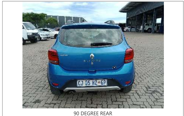
90 DEGREE REAR

DEKRA Automotive (PTY) Ltd. 97 Willem Cruywagen Ave Klerksoord, Pretoria, 0200 Phone: 012 542 4867 www.dekraauto.co.za