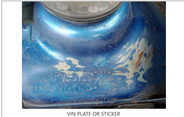
VIN PLATE OR STICKER