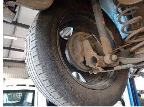
Rim Rear Left

DEKRA Automotive (PTY) Ltd. 97 Willem Cruywagen Ave Klerksoord, Pretoria, 0200 Phone: 012 542 4867 www.dekraauto.co.za