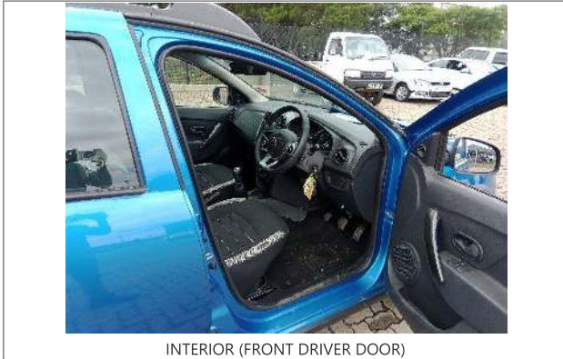
INTERIOR (FRONT DRIVER DOOR)

DATE: 17/01/2024 VIN: AAPV034210017001 4 / 14