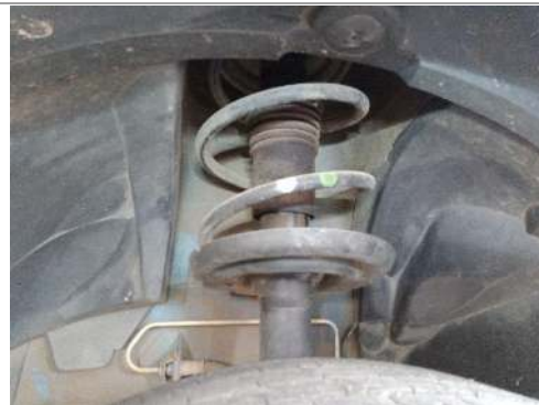
Shock Absorber Front Left