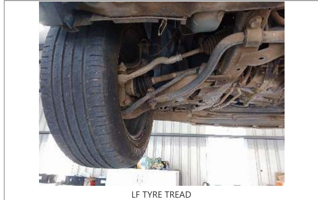
LF TYRE TREAD