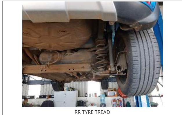
RR TYRE TREAD