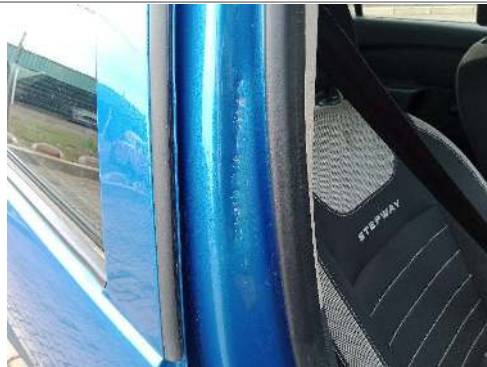
B • Pillar Right

DEKRA Automotive (PTY) Ltd. 97 Willem Cruywagen Ave Klerksoord, Pretoria, 0200 Phone: 012 542 4867 www.dekraauto.co.za