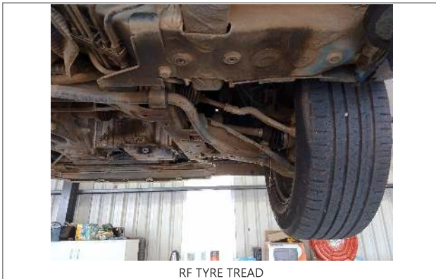
RF TYRE TREAD