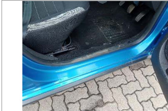
Sill Panel Right