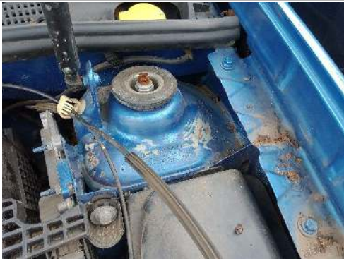
Bonnet slam plate (Shock tower/ Inner tray)