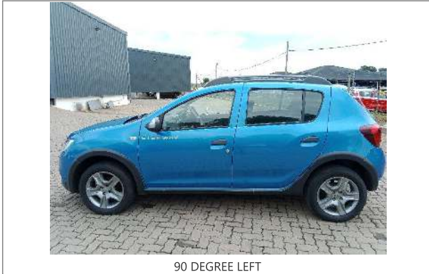
90 DEGREE LEFT