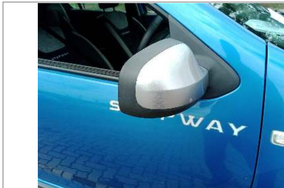
Side Mirror Right