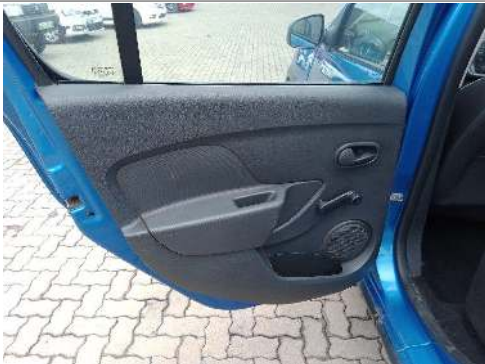
Door Panel Rear Left