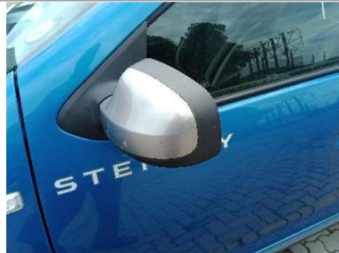
Side Mirror Left