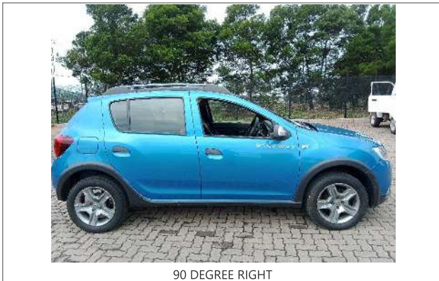
90 DEGREE RIGHT