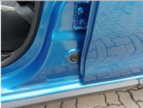
B • Pillar Left