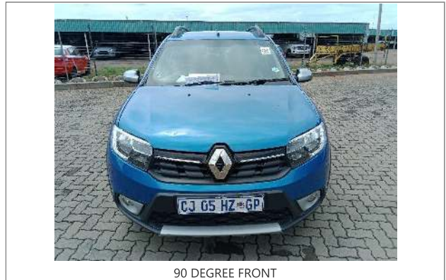
90 DEGREE FRONT