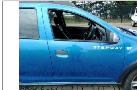
Door Front Right