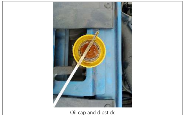
Oil cap and dipstick

DEKRA Automotive (PTY) Ltd. 97 Willem Cruywagen Ave Klerksoord, Pretoria, 0200 Phone: 012 542 4867 www.dekraauto.co.za