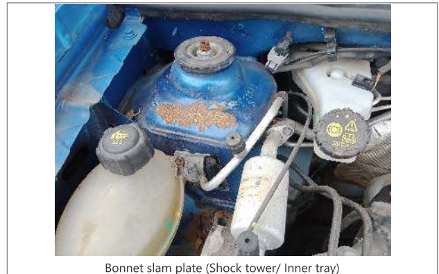
Bonnet slam plate (Shock tower/ Inner tray)

DEKRA Automotive (PTY) Ltd. 97 Willem Cruywagen Ave Klerksoord, Pretoria, 0200 Phone: 012 542 4867 www.dekraauto.co.za