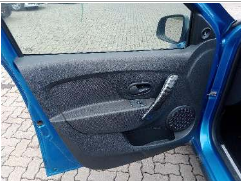
Door Panel Front Left