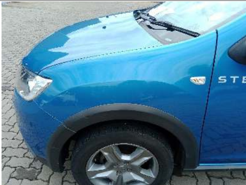
Front Fender Left