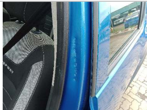
B • Pillar Left

DEKRA Automotive (PTY) Ltd. 97 Willem Cruywagen Ave Klerksoord, Pretoria, 0200 Phone: 012 542 4867 www.dekraauto.co.za