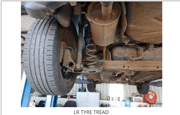
LR TYRE TREAD