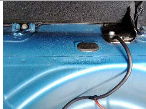
Inner Boot Floor Pan and Spare Wheel Well