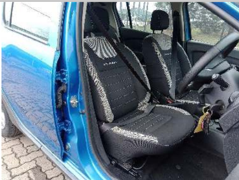
Seat Front Right