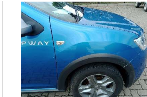
Front Fender Right

DEKRA Automotive (PTY) Ltd. 97 Willem Cruywagen Ave Klerksoord, Pretoria, 0200 Phone: 012 542 4867 www.dekraauto.co.za