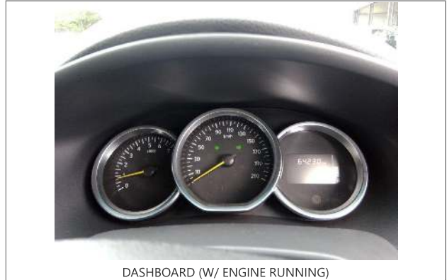
DASHBOARD (W/ ENGINE RUNNING)