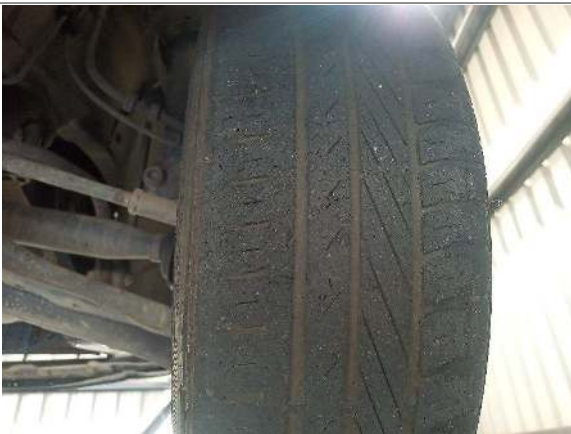
Tyre Front Right