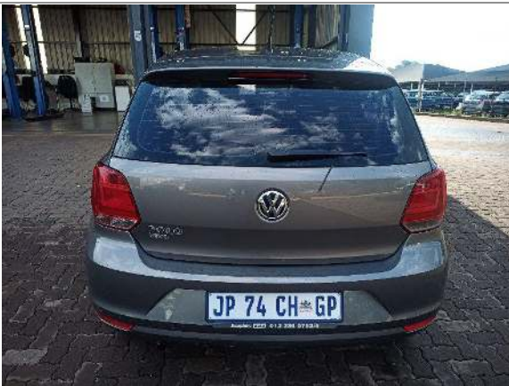
90 DEGREE REAR