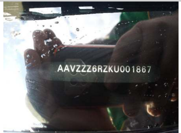
VIN PLATE OR STICKER