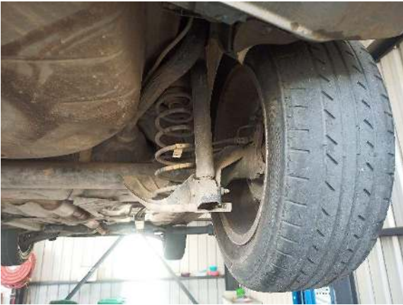
RR TYRE TREAD