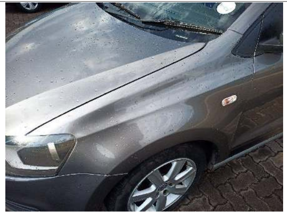
Front Fender Left