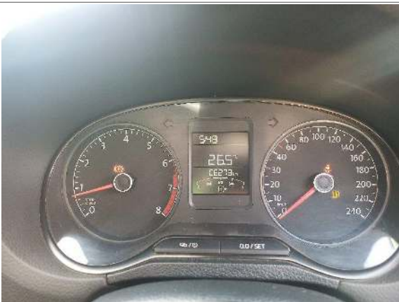
DASHBOARD (W/ ENGINE RUNNING)