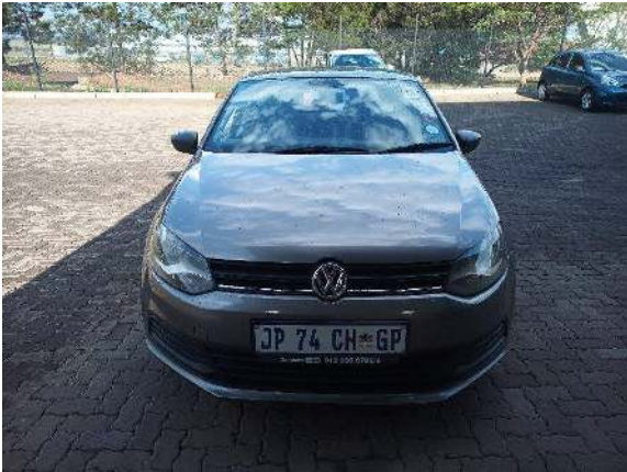
90 DEGREE FRONT