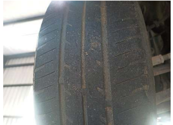
Tyre Front Left