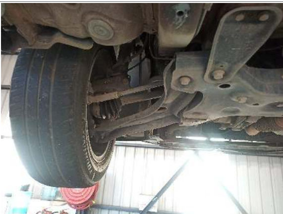
LF TYRE TREAD