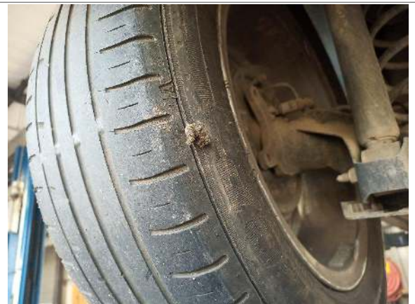
Tyre Rear Left