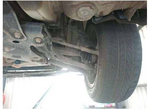
RF TYRE TREAD