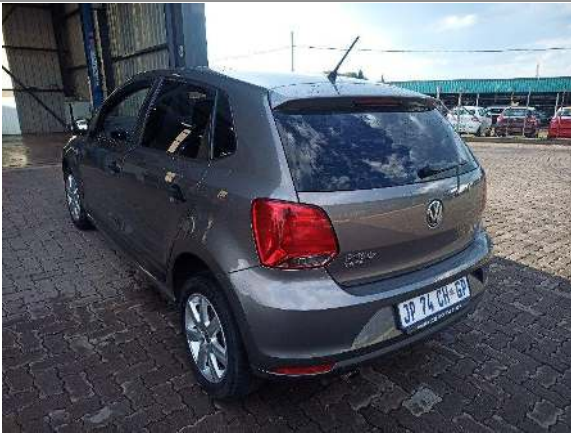
REAR LEFT CORNER