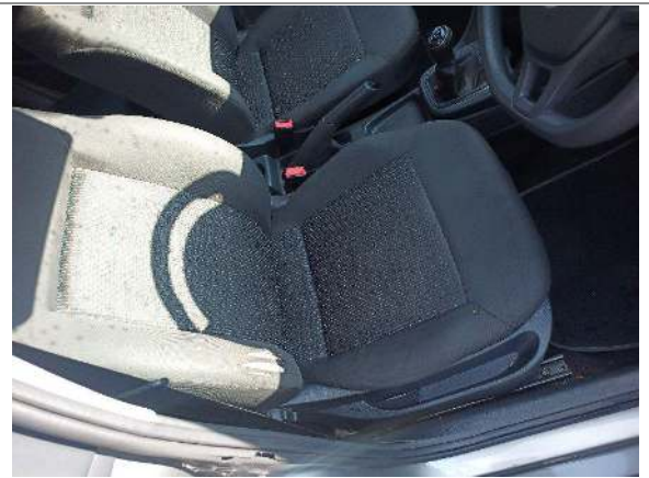
Seat Front Right