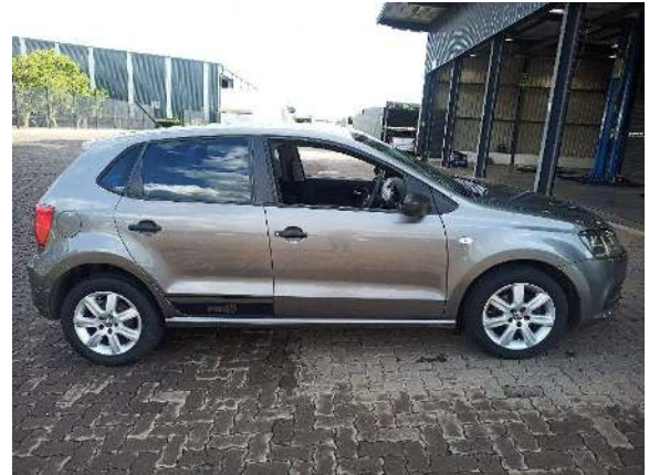
90 DEGREE RIGHT