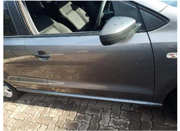
Door Front Right