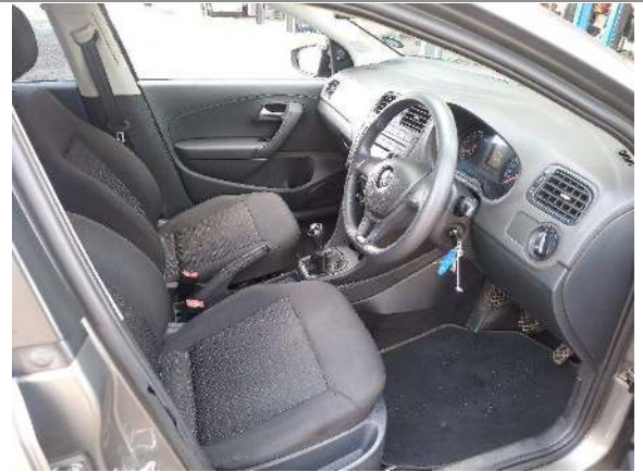
INTERIOR (FRONT DRIVER DOOR)