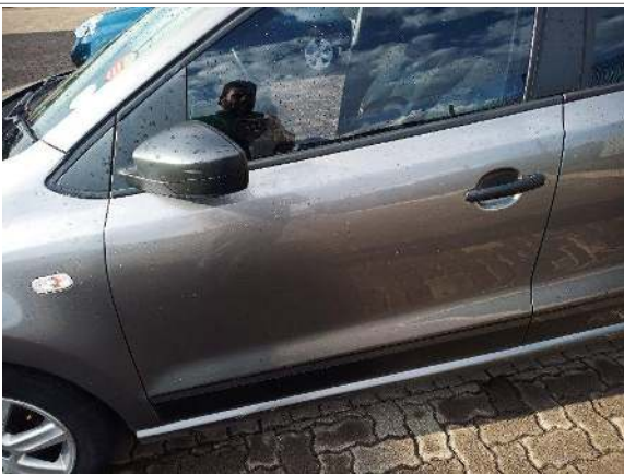
Door Front Left