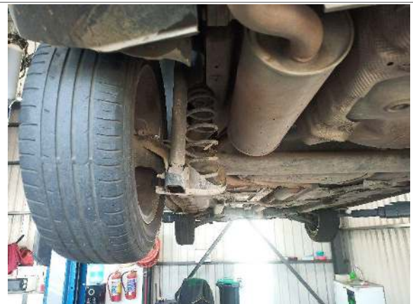
LR TYRE TREAD