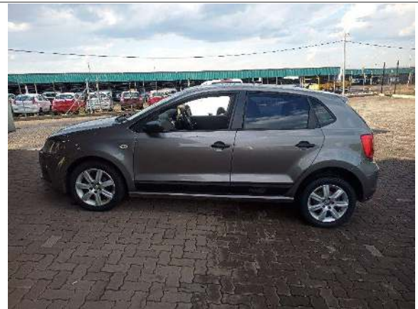
90 DEGREE LEFT