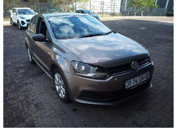
FRONT RIGHT CORNER