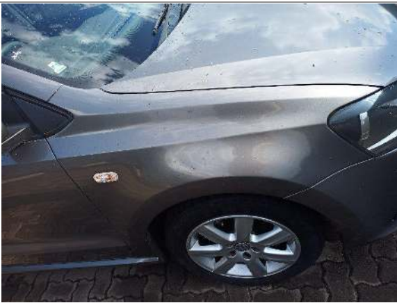
Front Fender Right