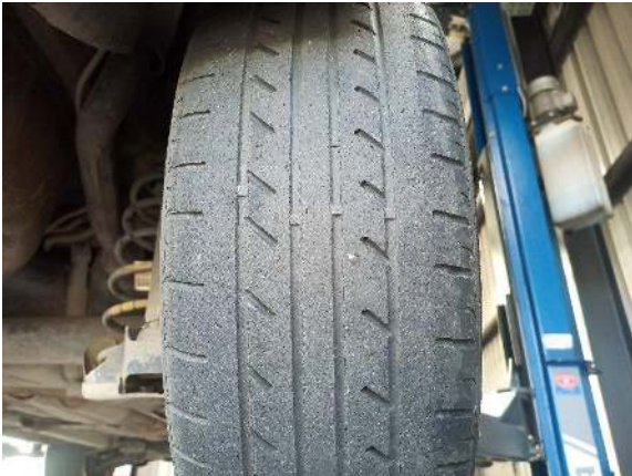
Tyre Rear Right