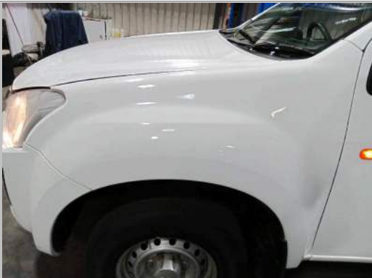
Front Fender Left