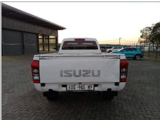
90 DEGREE REAR