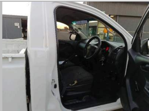
INTERIOR (FRONT DRIVER DOOR)