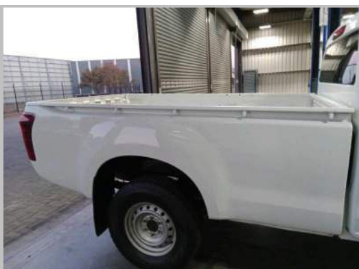
Rear Fender Right