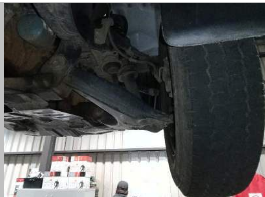
RF TYRE TREAD