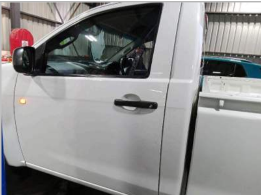
Door Front Left