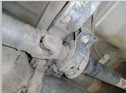
Center Prop Shaft Rubber(s)