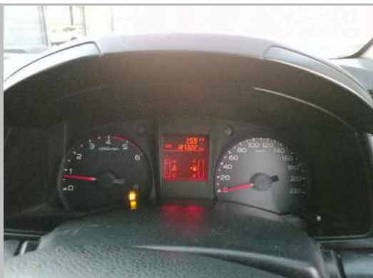
DASHBOARD (W/ ENGINE RUNNING)