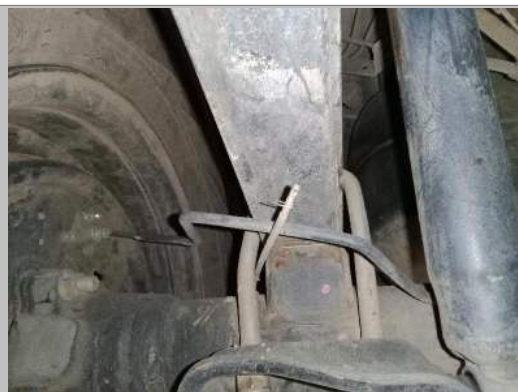
Rear left handbrake cable