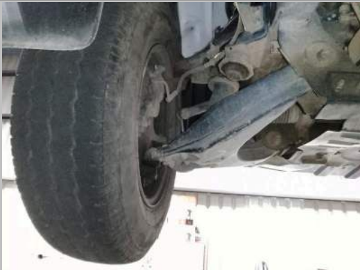
LF TYRE TREAD