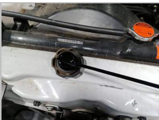
Oil cap and dipstick