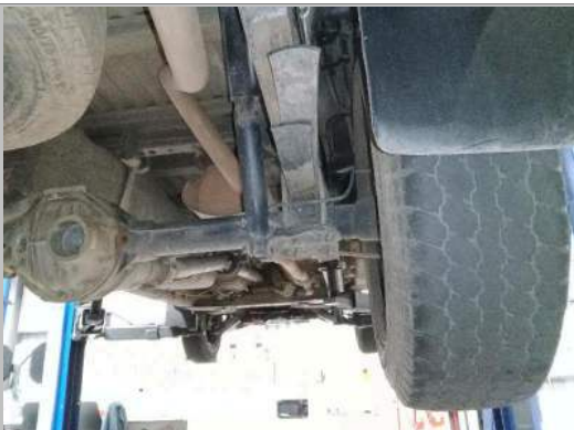
RR TYRE TREAD