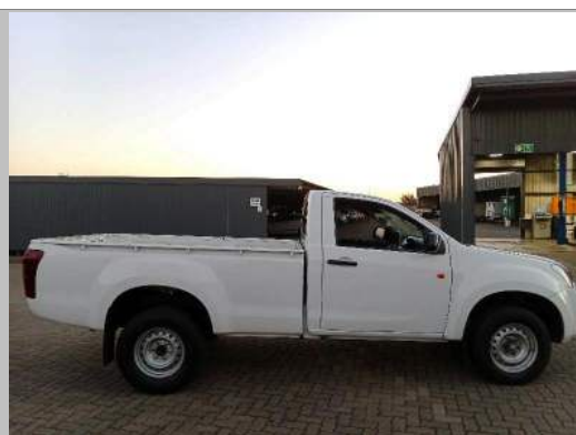
90 DEGREE RIGHT