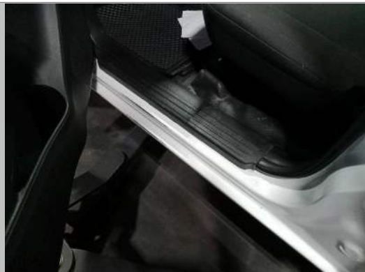
Sill Panel Left