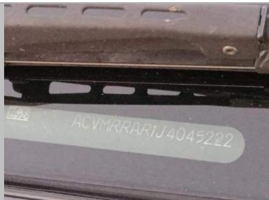
VIN PLATE OR STICKER