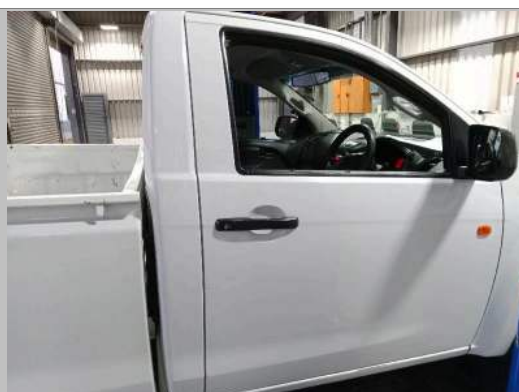
Door Front Right