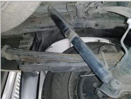
Spring Rear Left