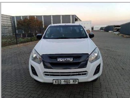
90 DEGREE FRONT