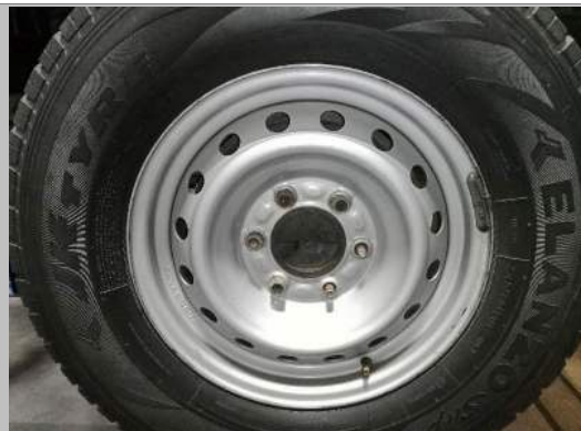
Bolt(s) / Nut(s) Rear Wheel Left