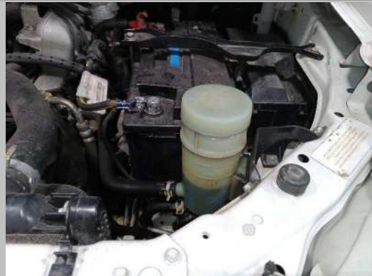
Power steering fluid level.