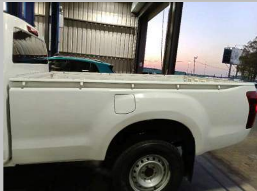
Rear Fender Left