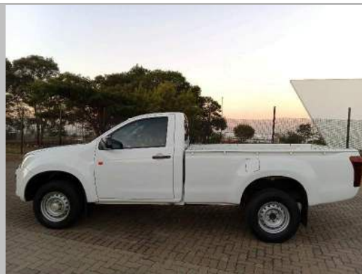
90 DEGREE LEFT