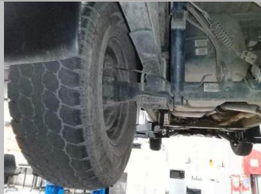
LR TYRE TREAD