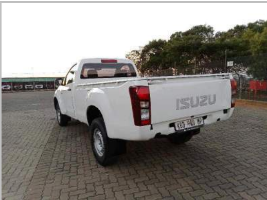
REAR LEFT CORNER