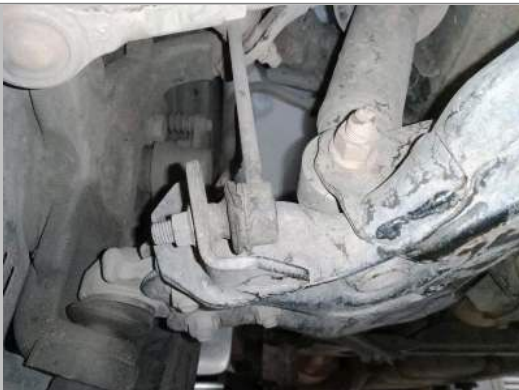
Stabilizer Mounting Front Right