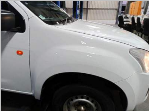
Front Fender Right