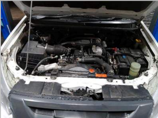
Bonnet slam plate (Shock tower/ Inner tray)