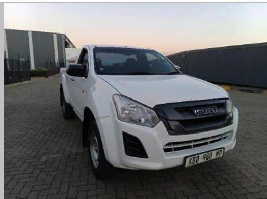
FRONT RIGHT CORNER