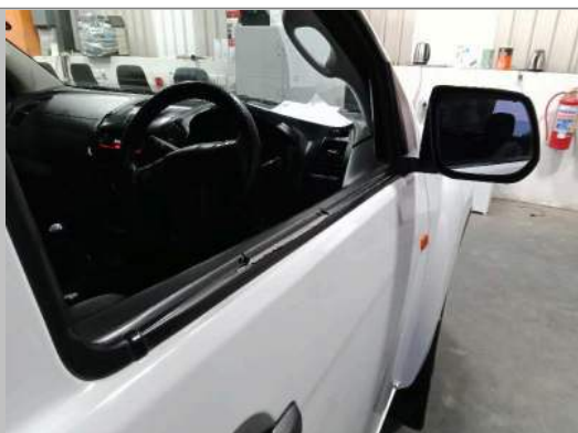
Weather Strip Door Front Right