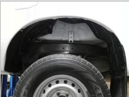
Rear Fender Left / Inner Tray