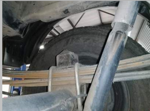
Spring Rear Right