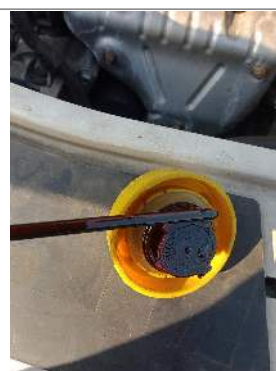
Oil cap and dipstick.