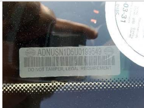
VIN PLATE OR STICKER

DEKRA Automotive (PTY) Ltd. 97 Willem Cruywagen Ave Klerksoord, Pretoria, 0200 Phone: 012 542 4867 www.dekraauto.co.za