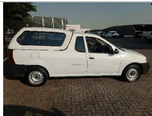
90 DEGREE RIGHT