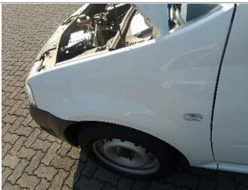
Front Fender Left