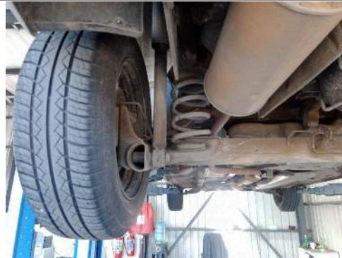
LR TYRE TREAD