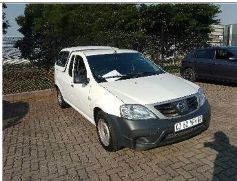
FRONT RIGHT CORNER