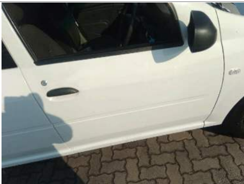
Door Front Right