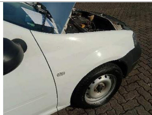
Front Fender Right