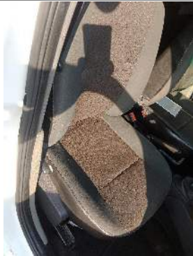
Seat Front Right