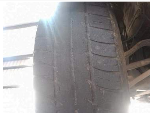
Tyre Front Left

DEKRA Automotive (PTY) Ltd. 97 Willem Cruywagen Ave Klerksoord, Pretoria, 0200 Phone: 012 542 4867 www.dekraauto.co.za