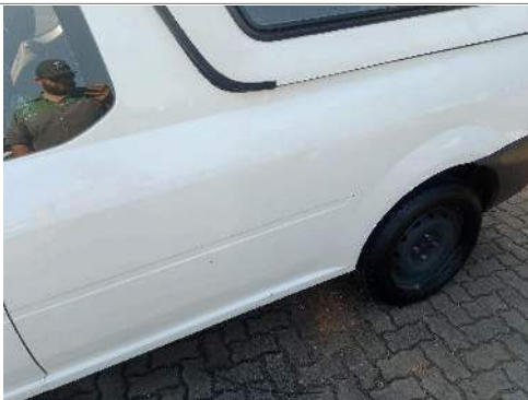
Rear Fender Left