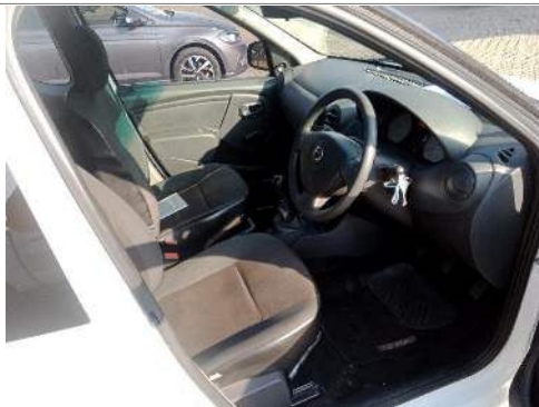
INTERIOR (FRONT DRIVER DOOR)