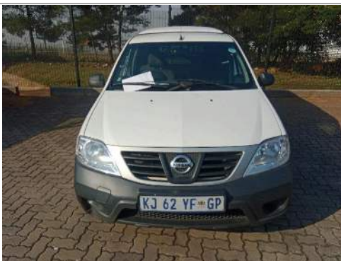
90 DEGREE FRONT