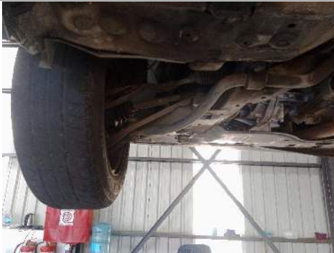
LF TYRE TREAD