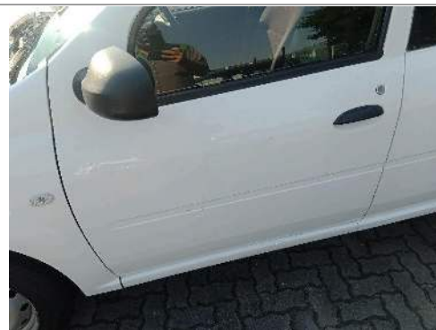
Door Front Left