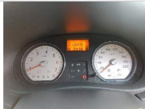
DASHBOARD (W/ ENGINE RUNNING)

DEKRA Automotive (PTY) Ltd. 97 Willem Cruywagen Ave Klerksoord, Pretoria, 0200 Phone: 012 542 4867 www.dekraauto.co.za