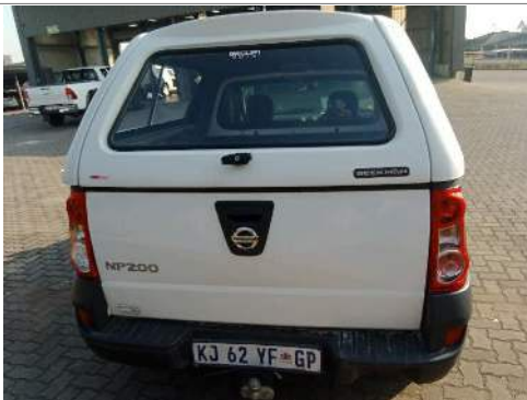
90 DEGREE REAR