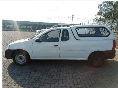
90 DEGREE LEFT

DEKRA Automotive (PTY) Ltd. 97 Willem Cruywagen Ave Klerksoord, Pretoria, 0200 Phone: 012 542 4867 www.dekraauto.co.za