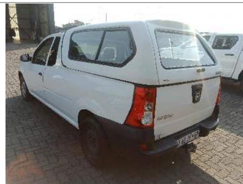
REAR LEFT CORNER