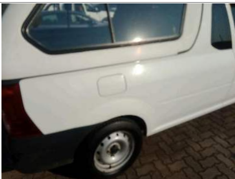
Rear Fender Right