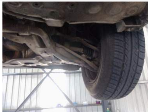
RF TYRE TREAD