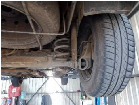
RR TYRE TREAD