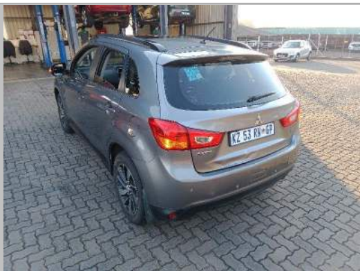
REAR LEFT CORNER