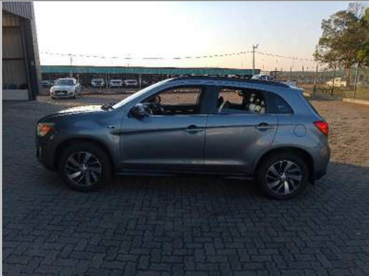
90 DEGREE LEFT