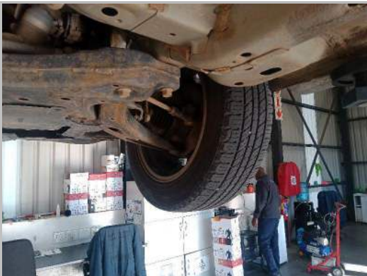
RF TYRE TREAD