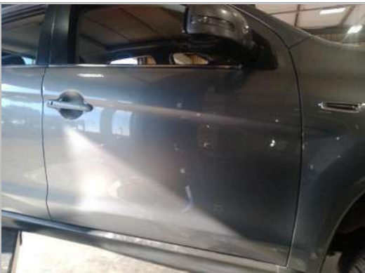
Door Front Right