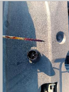
Oil cap and dipstick