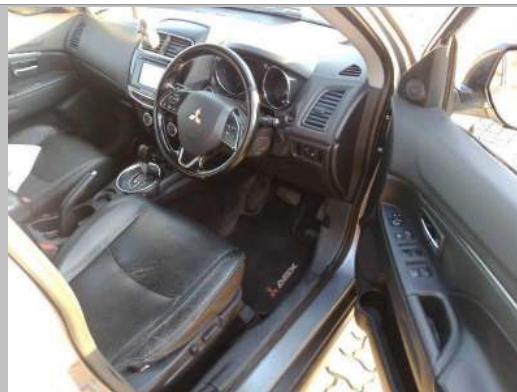
INTERIOR (FRONT DRIVER DOOR)