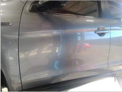
Door Front Left