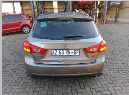
90 DEGREE REAR