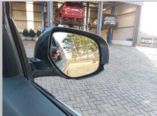
Side Mirror Right