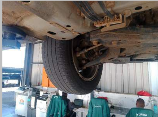
LF TYRE TREAD