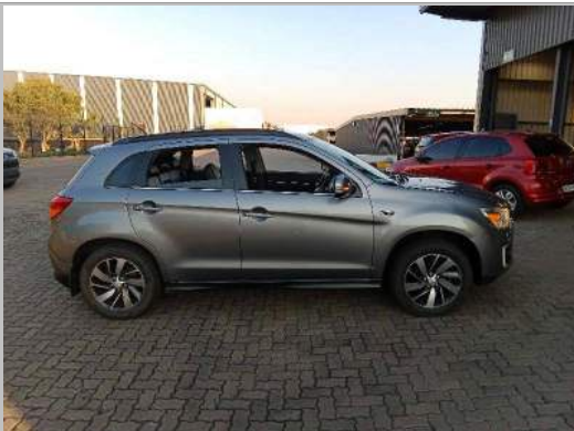
90 DEGREE RIGHT