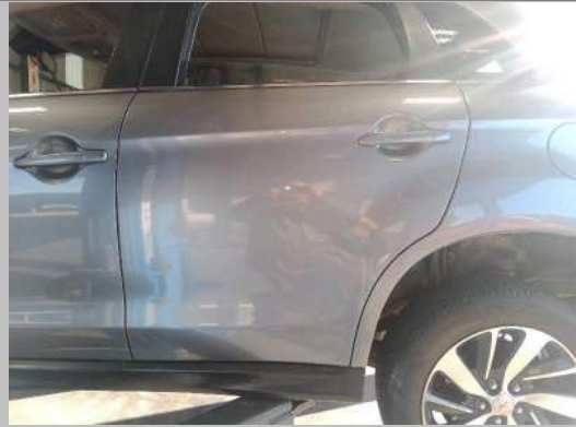
Door Rear Left