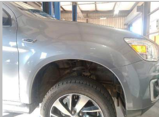
Front Fender Right