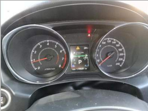
DASHBOARD (W/ ENGINE RUNNING)