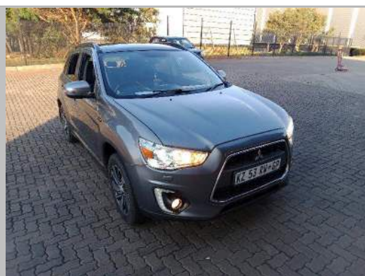
FRONT RIGHT CORNER