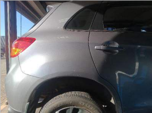
Rear Fender Right