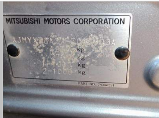
VIN PLATE OR STICKER