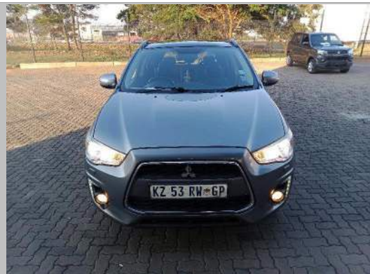
90 DEGREE FRONT