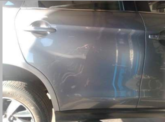
Door Rear Right