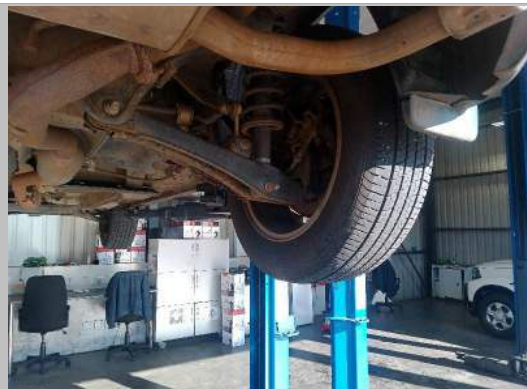
RR TYRE TREAD