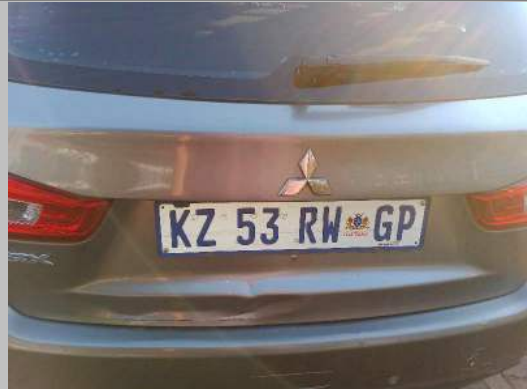
Boot Lid / Hatch door