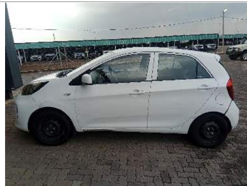
90 DEGREE LEFT

DEKRA Automotive (PTY) Ltd. 97 Willem Cruywagen Ave Klerksoord, Pretoria, 0200 Phone: 012 542 4867 www.dekraauto.co.za