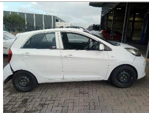
90 DEGREE RIGHT