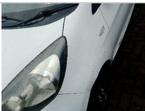
Front Fender Left