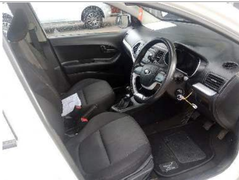
INTERIOR (FRONT DRIVER DOOR)