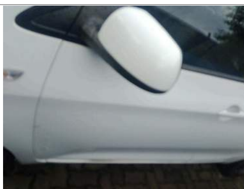
Door Front Left