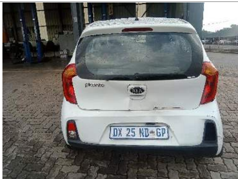
90 DEGREE REAR