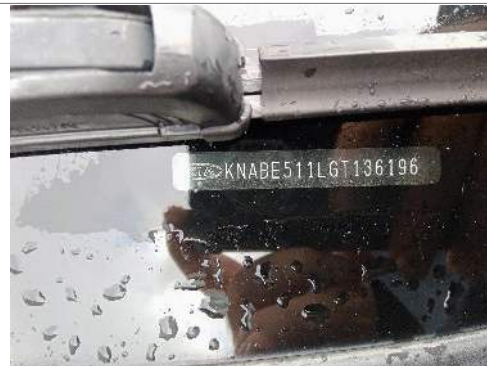
VIN PLATE OR STICKER

DEKRA Automotive (PTY) Ltd. 97 Willem Cruywagen Ave Klerksoord, Pretoria, 0200 Phone: 012 542 4867 www.dekraauto.co.za