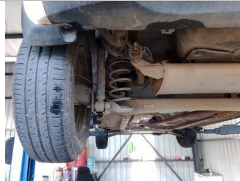
LR TYRE TREAD