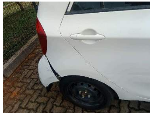
Rear Fender Right

DEKRA Automotive (PTY) Ltd. 97 Willem Cruywagen Ave Klerksoord, Pretoria, 0200 Phone: 012 542 4867 www.dekraauto.co.za