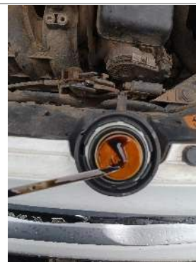
Oil cap and dipstick.