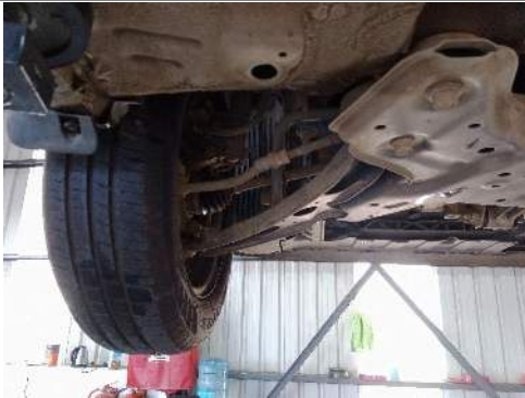
LF TYRE TREAD