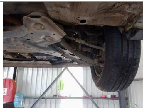
RF TYRE TREAD