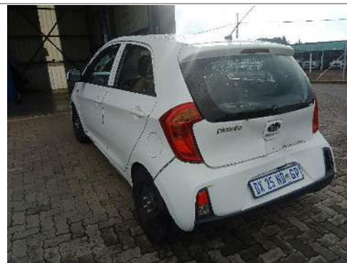
REAR LEFT CORNER