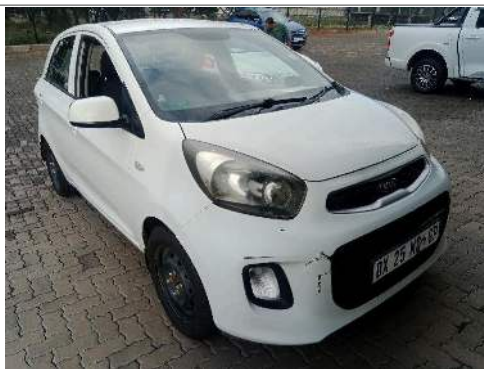
FRONT RIGHT CORNER