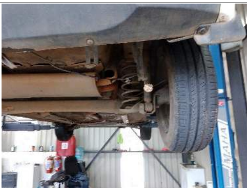
RR TYRE TREAD