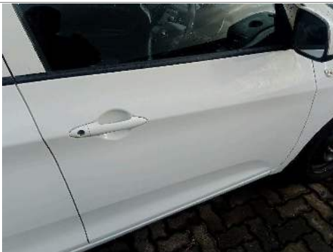
Door Front Right