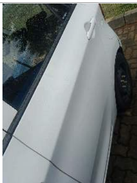
Door Rear Left