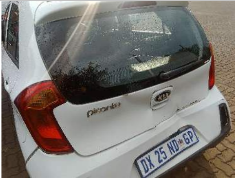
Boot Lid / Hatch door