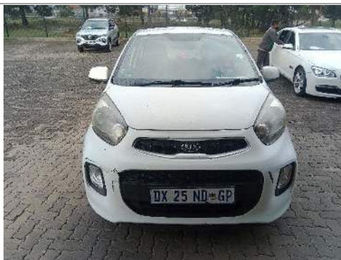
90 DEGREE FRONT