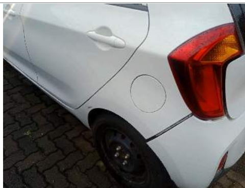
Rear Fender Left

DEKRA Automotive (PTY) Ltd. 97 Willem Cruywagen Ave Klerksoord, Pretoria, 0200 Phone: 012 542 4867 www.dekraauto.co.za