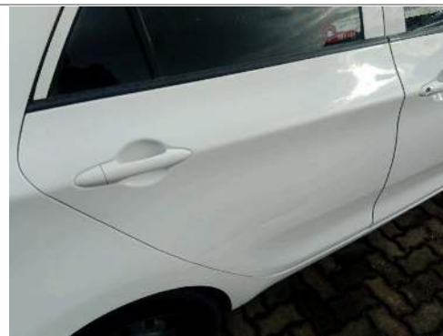
Door Rear Right