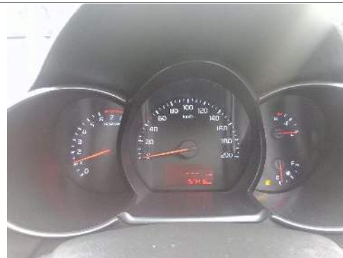
DASHBOARD (W/ ENGINE RUNNING)

DEKRA Automotive (PTY) Ltd. 97 Willem Cruywagen Ave Klerksoord, Pretoria, 0200 Phone: 012 542 4867 www.dekraauto.co.za