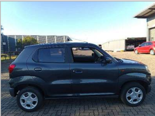
90 DEGREE RIGHT