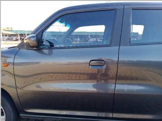
Door Front Left