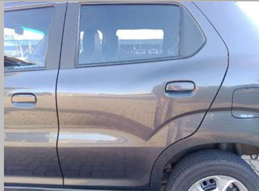
Door Rear Left