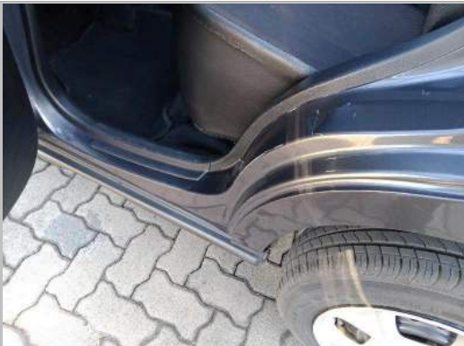
Sill Panel Left