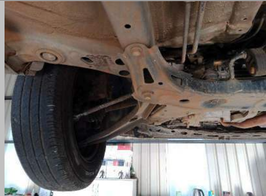
LF TYRE TREAD