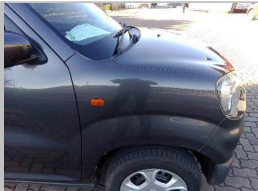
Front Fender Right