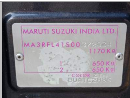
VIN PLATE OR STICKER