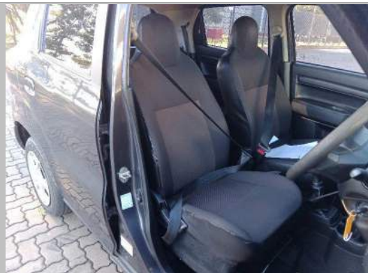
Seat Front Right