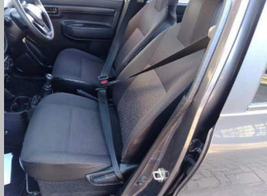
Seat Front Left