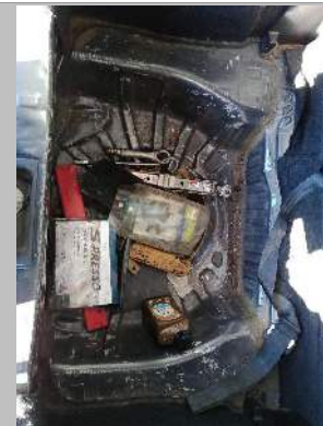
Spare wheel Accessories