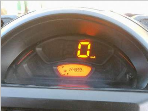
DASHBOARD (W/ ENGINE RUNNING)