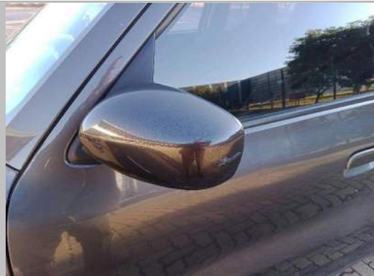
Side Mirror Left