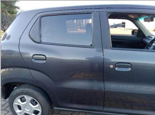
Door Rear Right