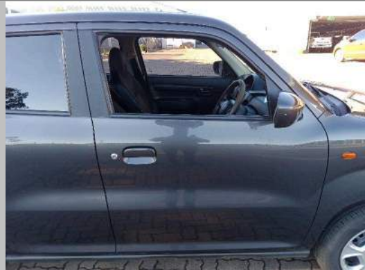
Door Front Right