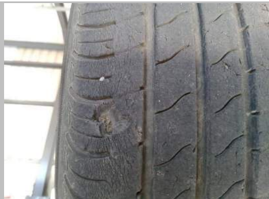
Tyre Front Left