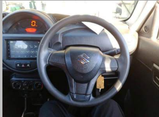
Steering Wheel Trim