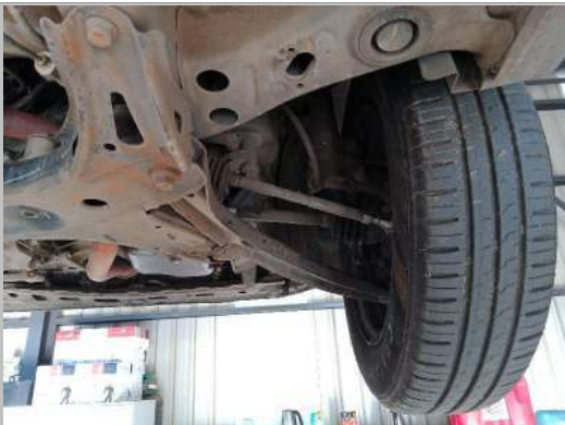
LR TYRE TREAD