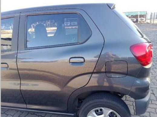
Rear Fender Left