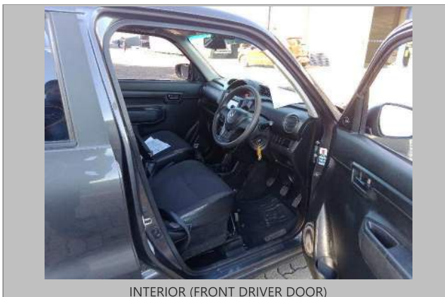
INTERIOR (FRONT DRIVER DOOR)