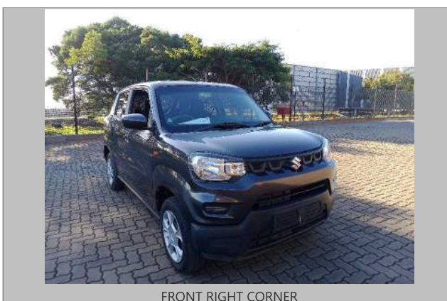
FRONT RIGHT CORNER