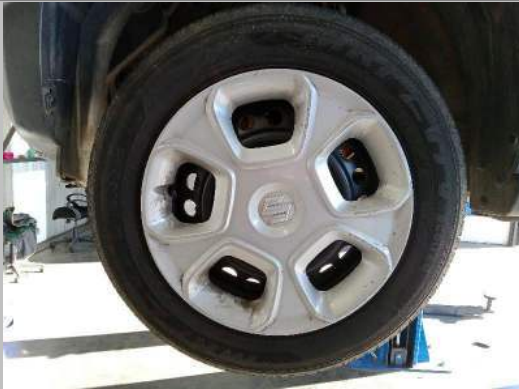
Tyre Front Left