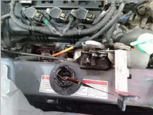
Oil cap and dipstick