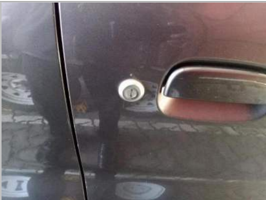
Door Lock Front Right

DEKRA Automotive (PTY) Ltd. 97 Willem Cruywagen Ave Klerksoord, Pretoria, 0200 Phone: 012 542 4867 www.dekraauto.co.za