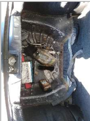
Inner Boot Floor Pan and Spare Wheel Well