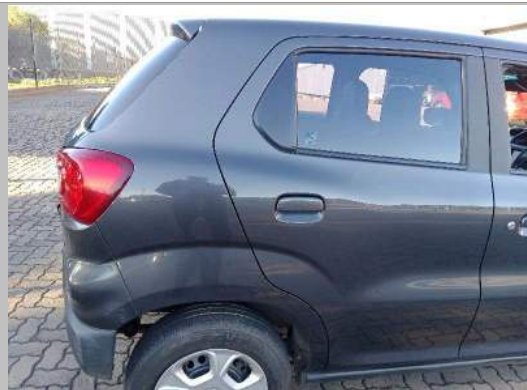
Rear Fender Right