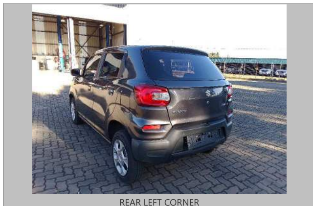
REAR LEFT CORNER