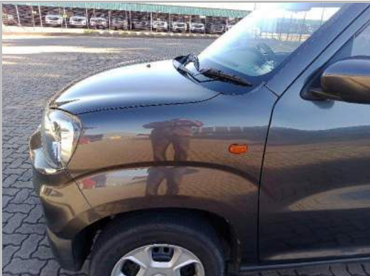
Front Fender Left