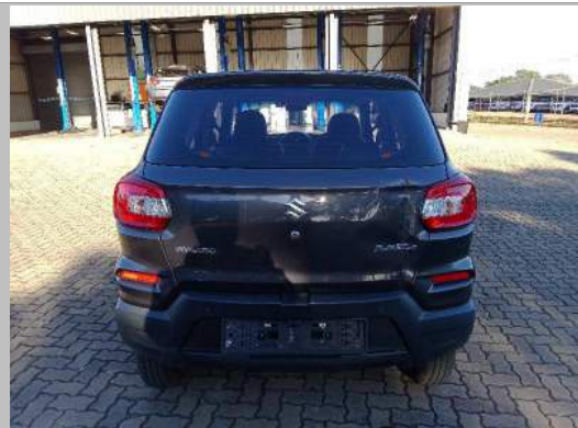
90 DEGREE REAR