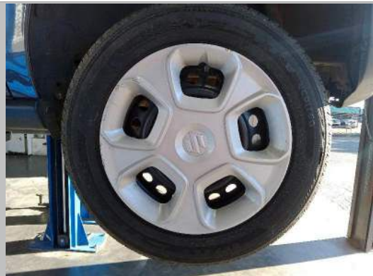
Tyre Rear Left