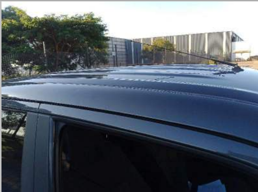
B • Pillar Right