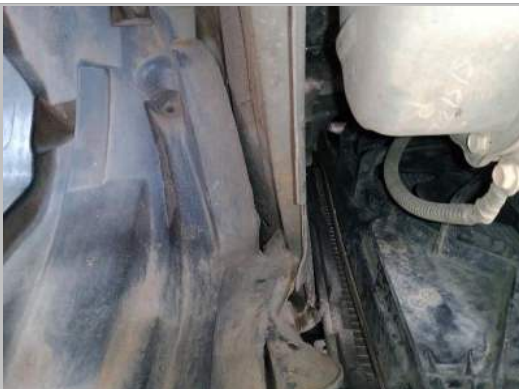
Main Beam Left