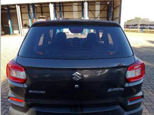
Boot Lid / Hatch door