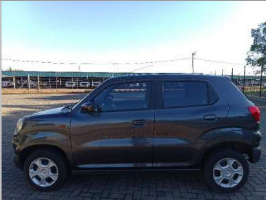
90 DEGREE LEFT