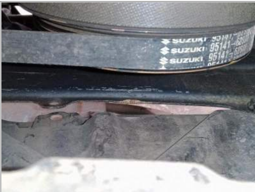
Main Beam Right