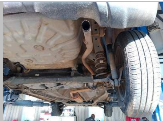
RR TYRE TREAD