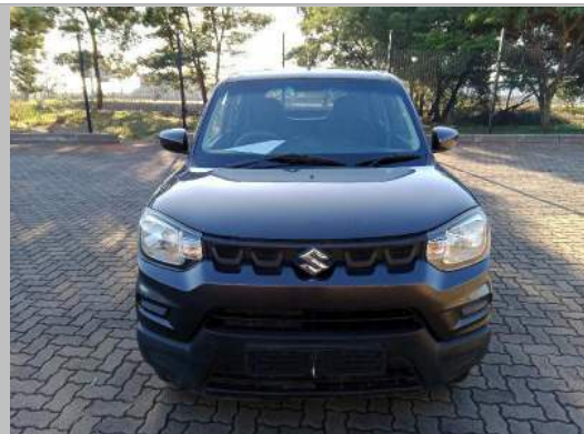
90 DEGREE FRONT