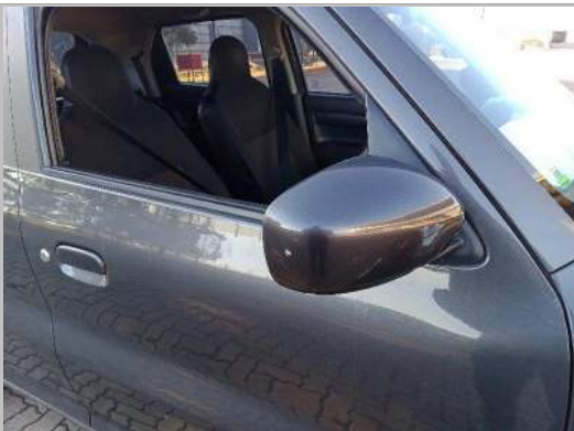
Side Mirror Right