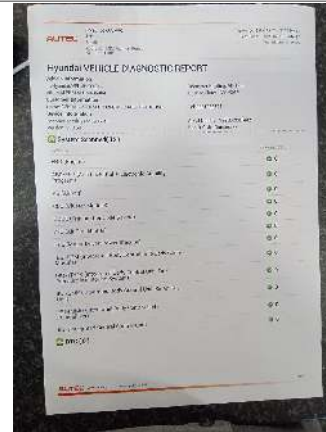
DIAGNOSTIC REPORT PAGE 1