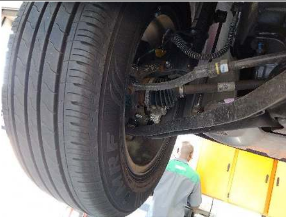
LF TYRE TREAD