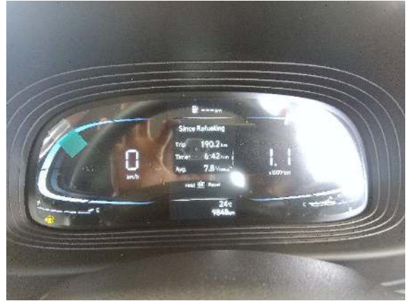
DASHBOARD (W/ ENGINE RUNNING)