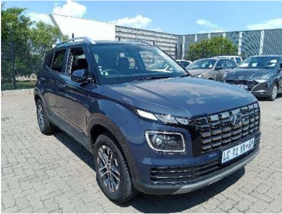
FRONT RIGHT CORNER