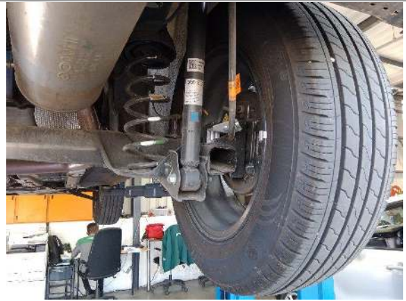
RR TYRE TREAD