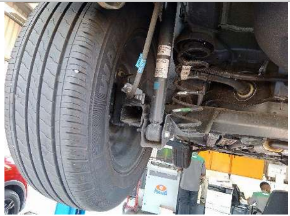
LR TYRE TREAD