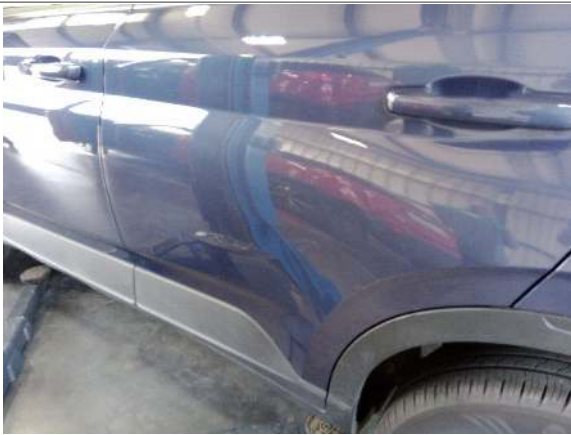
Door Rear Left