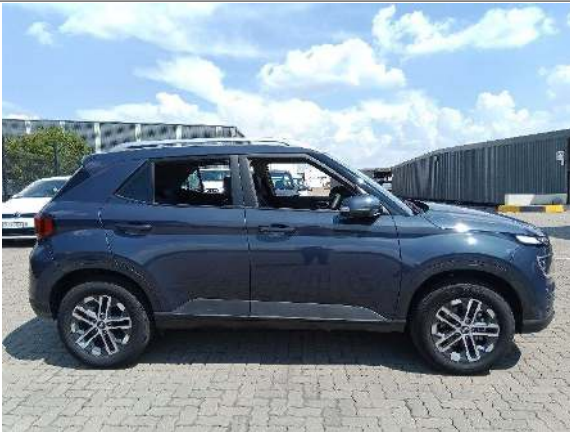
90 DEGREE RIGHT