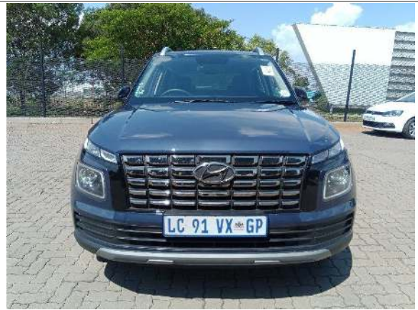
90 DEGREE FRONT