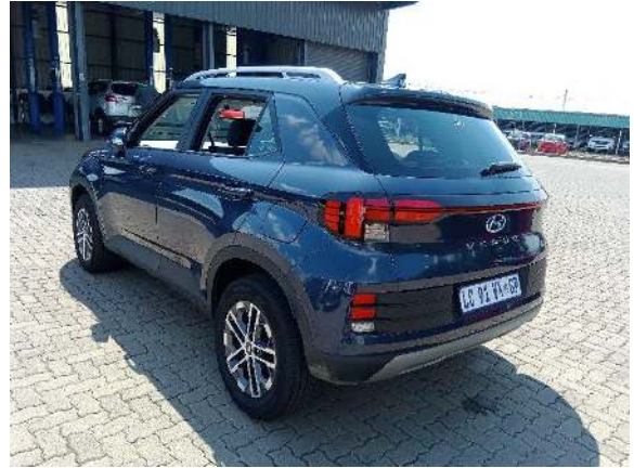
REAR LEFT CORNER