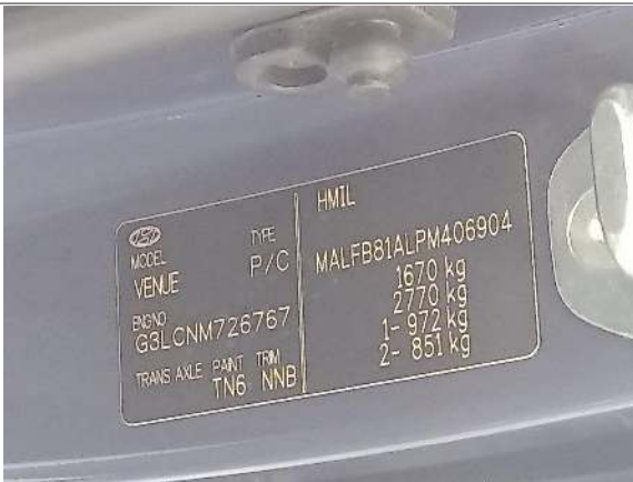
VIN PLATE OR STICKER