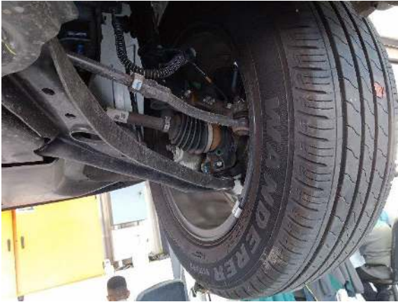
RF TYRE TREAD