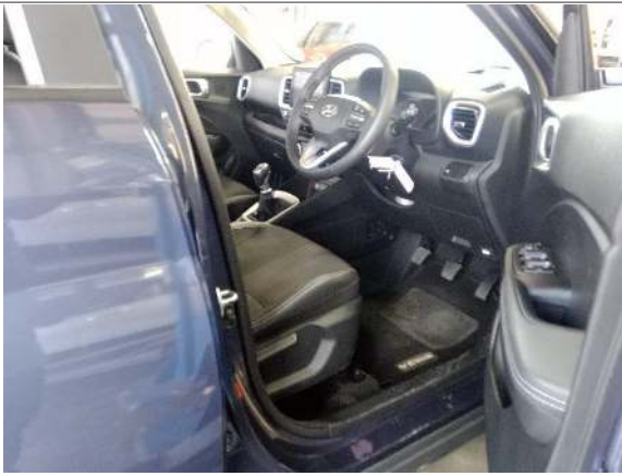
INTERIOR (FRONT DRIVER DOOR)