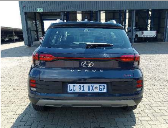
90 DEGREE REAR