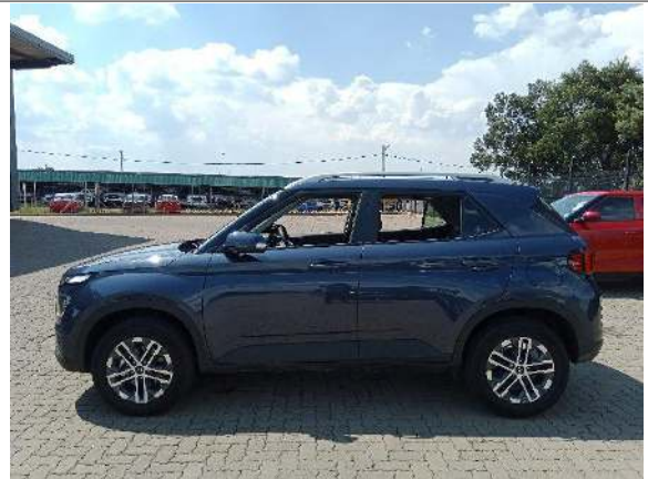
90 DEGREE LEFT