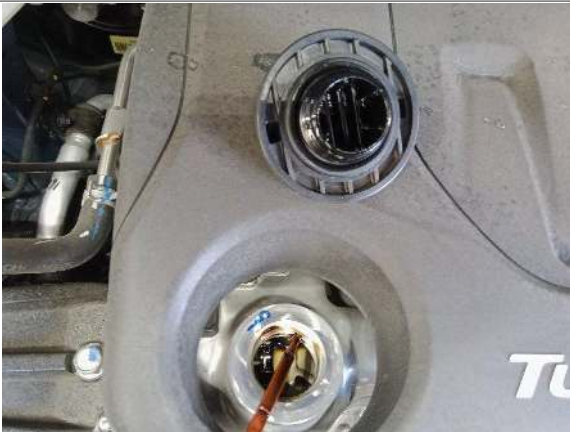
OIL CAP AND DIPSTICK