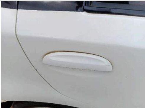
Door Handle Rear Right