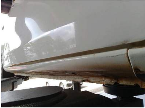
Sill Panel Right