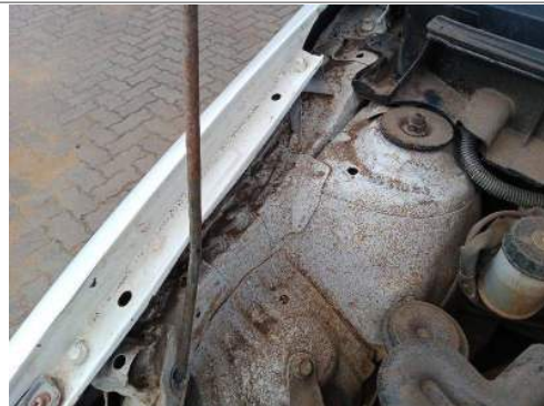
Front Fender Right / Inner Tray

DEKRA Automotive (PTY) Ltd. 97 Willem Cruywagen Ave Klerksoord, Pretoria, 0200 Phone: 012 542 4867 www.dekraauto.co.za