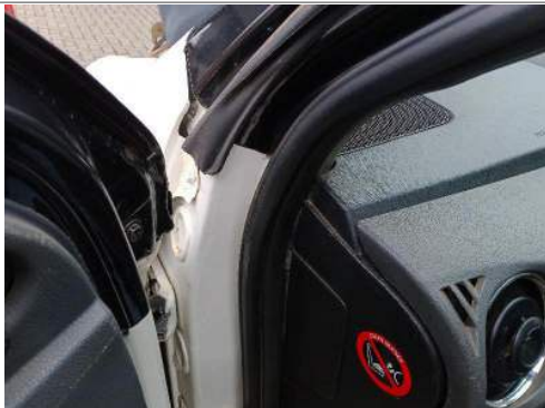
A • Pillar Left