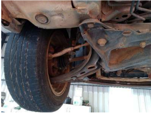
LF TYRE TREAD