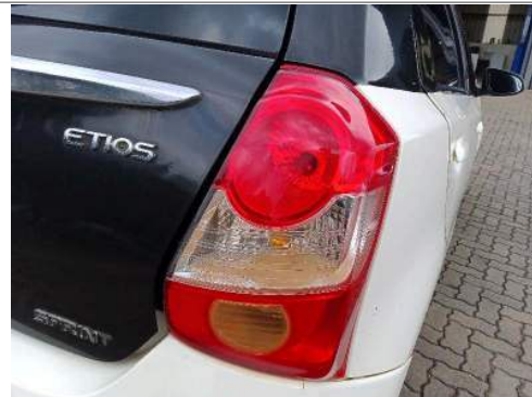
Tail Light Right

DEKRA Automotive (PTY) Ltd. 97 Willem Cruywagen Ave Klerksoord, Pretoria, 0200 Phone: 012 542 4867 www.dekraauto.co.za