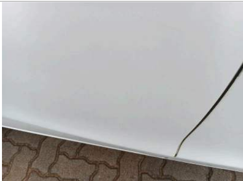
Door Rear Right