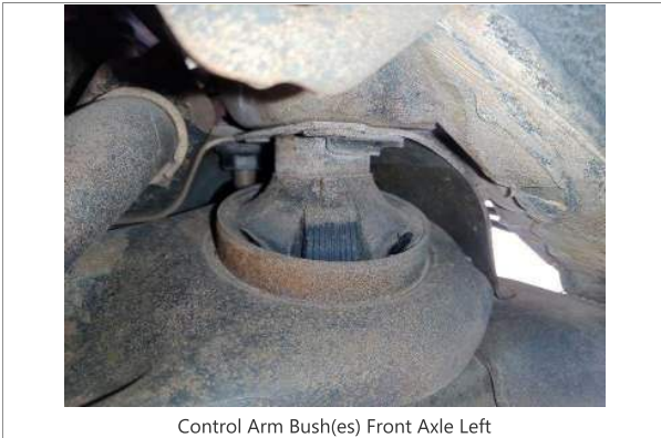
Control Arm Bush(es) Front Axle Left