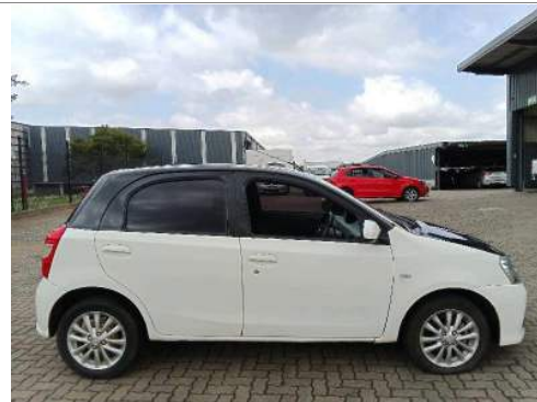
90 DEGREE RIGHT