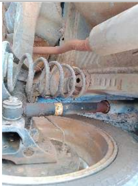
Shock Absorber Rear Right