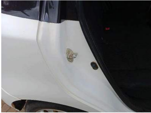
C • Pillar Right