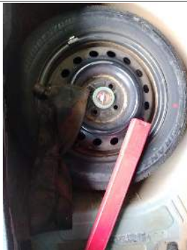
Spare wheel and Accessories