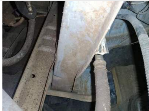
Main Beam Right