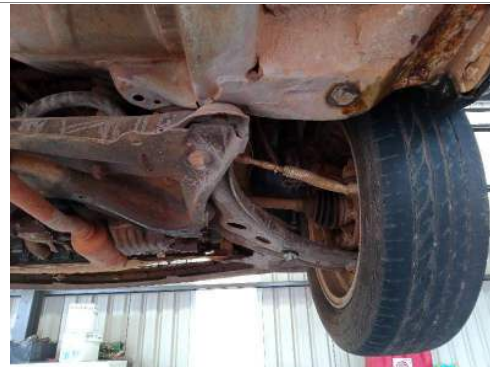
RF TYRE TREAD