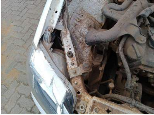
Bonnet slam plate (Shock tower/ Inner tray)