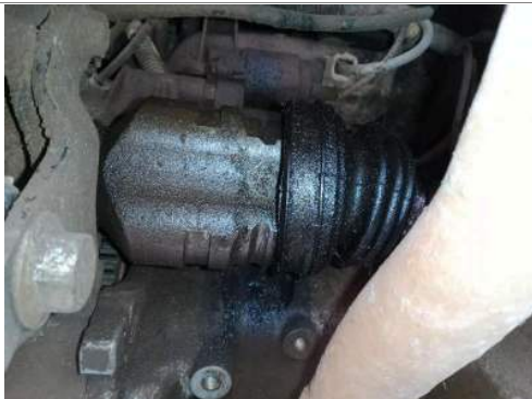
CV Joint(s) Boot(s) Front Right (inner/outer)