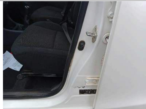
B • Pillar Left

DEKRA Automotive (PTY) Ltd. 97 Willem Cruywagen Ave Klerksoord, Pretoria, 0200 Phone: 012 542 4867 www.dekraauto.co.za