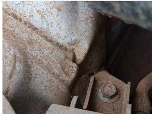
Bonnet slam plate (Shock tower/ Inner tray)