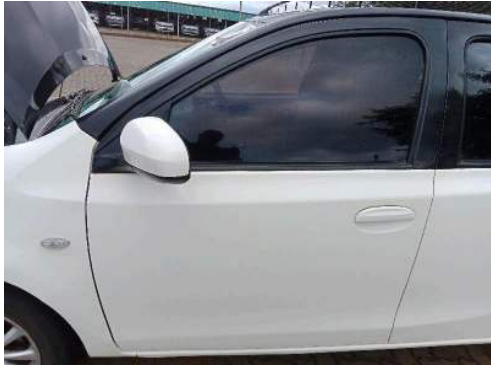
Door Front Left