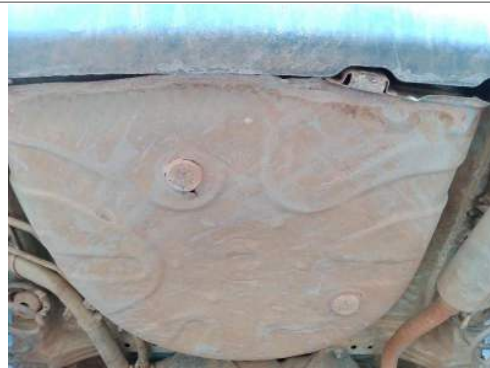
Inner Boot Floor Pan and Spare Wheel Well

DEKRA Automotive (PTY) Ltd. 97 Willem Cruywagen Ave Klerksoord, Pretoria, 0200 Phone: 012 542 4867 www.dekraauto.co.za