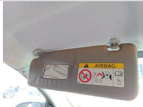
Sun Visor Left