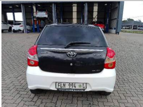
90 DEGREE REAR