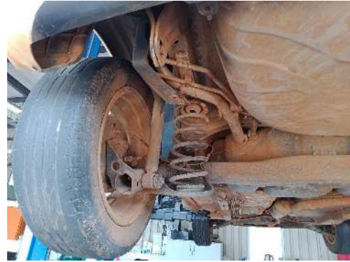
LR TYRE TREAD