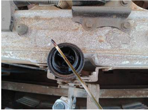
Oil cap and dipstick