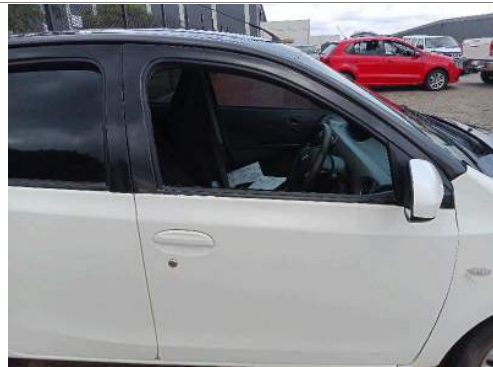
Door Front Right