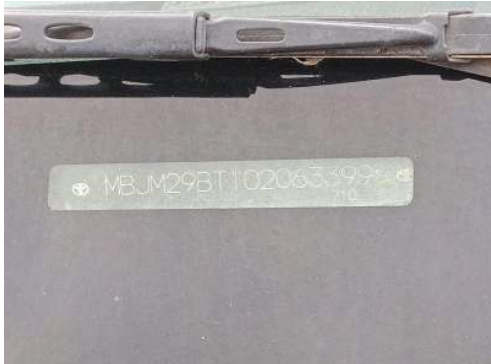
VIN PLATE OR STICKER