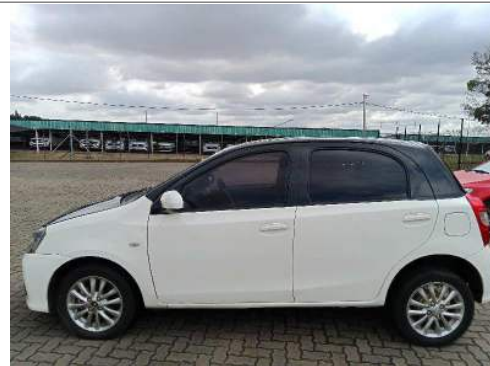
90 DEGREE LEFT

DEKRA Automotive (PTY) Ltd. 97 Willem Cruywagen Ave Klerksoord, Pretoria, 0200 Phone: 012 542 4867 www.dekraauto.co.za