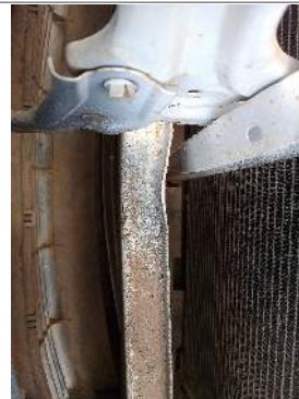
Front bumper stiffener

DEKRA Automotive (PTY) Ltd. 97 Willem Cruywagen Ave Klerksoord, Pretoria, 0200 Phone: 012 542 4867 www.dekraauto.co.za