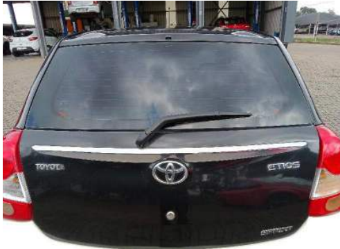
Boot Lid / Hatch door