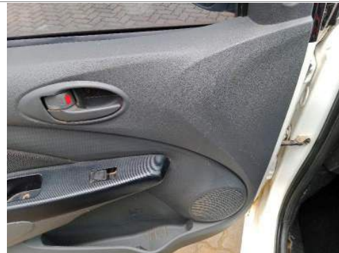
Door Panel Front Left