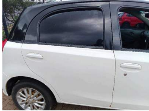
Door Rear Right