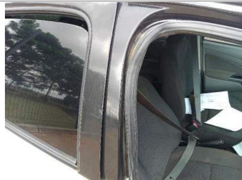
B • Pillar Right

DEKRA Automotive (PTY) Ltd. 97 Willem Cruywagen Ave Klerksoord, Pretoria, 0200 Phone: 012 542 4867 www.dekraauto.co.za