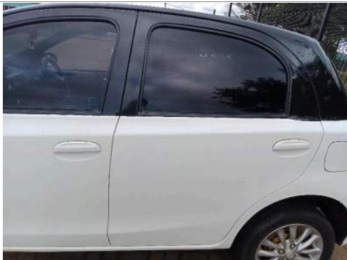
Door Rear Left