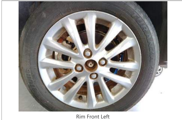
Rim Front Left