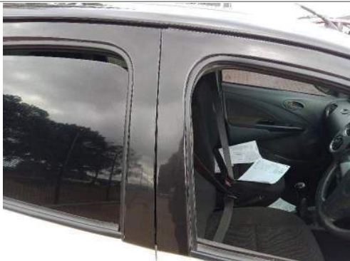
Door Front Right