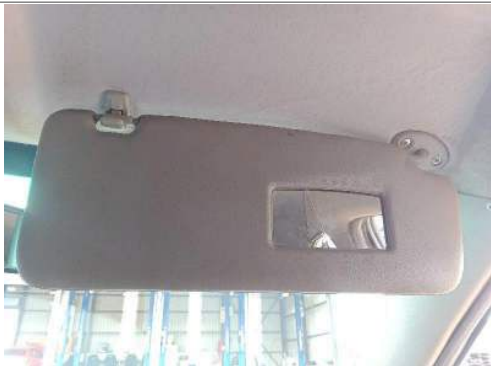
Sun Visor Right