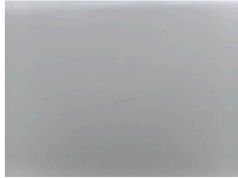
Door Front Left