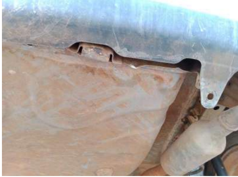
Inner Boot Floor Pan and Spare Wheel Well