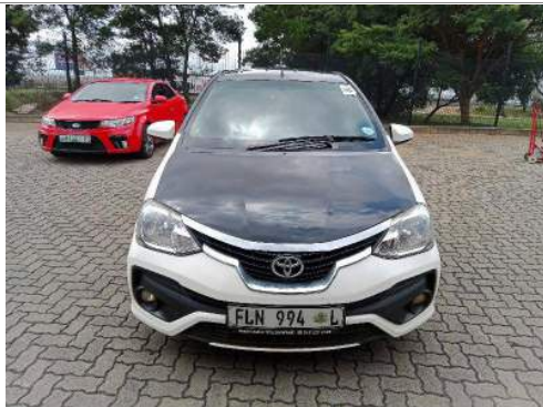
90 DEGREE FRONT