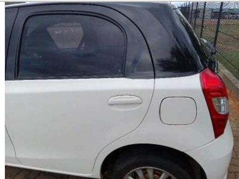
Rear Fender Left