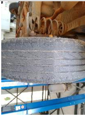
Tyre Rear Right