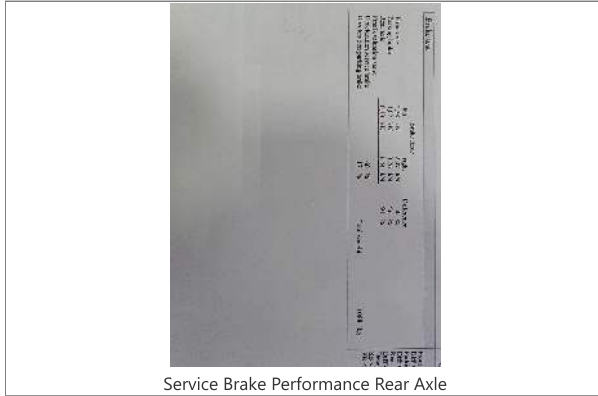
Service Brake Performance Rear Axle