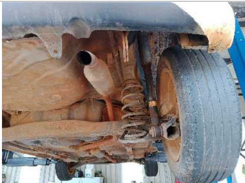
RR TYRE TREAD