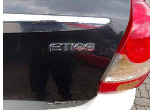
Boot Lid / Hatch door