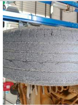
Tyre Rear Left