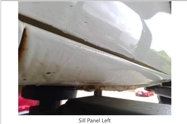
Sill Panel Left

DEKRA Automotive (PTY) Ltd. 97 Willem Cruywagen Ave Klerksoord, Pretoria, 0200 Phone: 012 542 4867 www.dekraauto.co.za