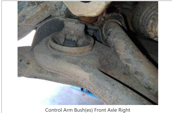
Control Arm Bush(es) Front Axle Right