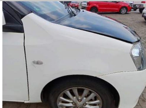
Front Fender Right

DEKRA Automotive (PTY) Ltd. 97 Willem Cruywagen Ave Klerksoord, Pretoria, 0200 Phone: 012 542 4867 www.dekraauto.co.za