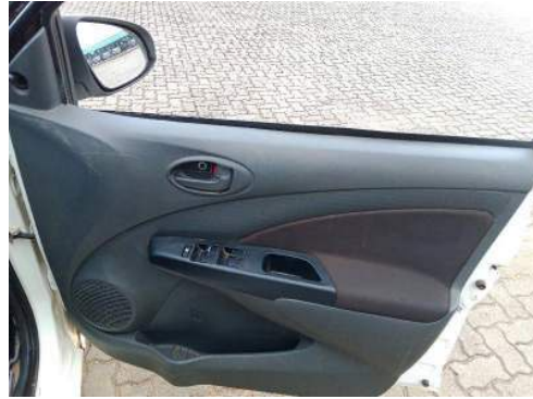
Door Panel Front Right