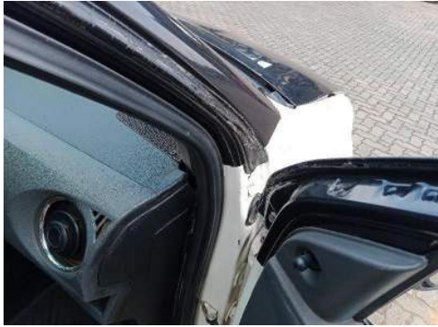
A • Pillar Right