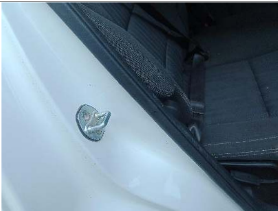
Door Sealing Rubber Rear Right