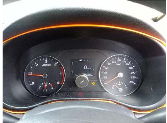
DASHBOARD (W/ ENGINE RUNNING)