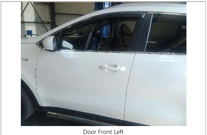
Door Front Left