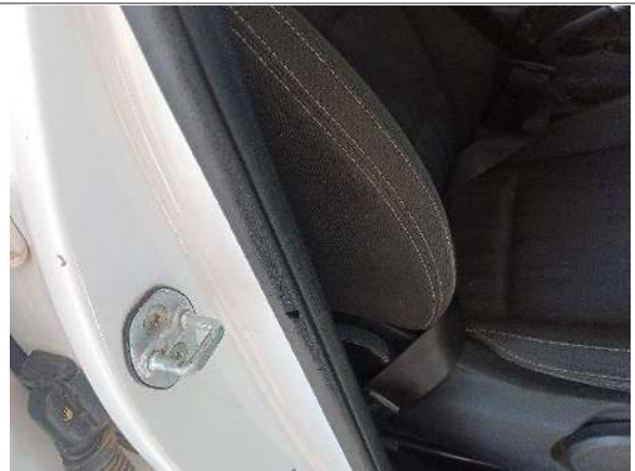
Door Sealing Rubber Front Right