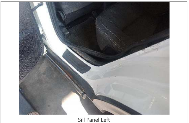
Sill Panel Left