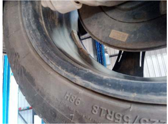
Rim Rear Right