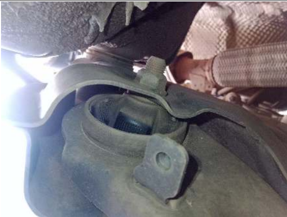
Control Arm Bush(es) Front Axle Right