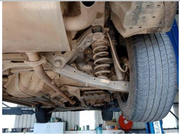
RR TYRE TREAD