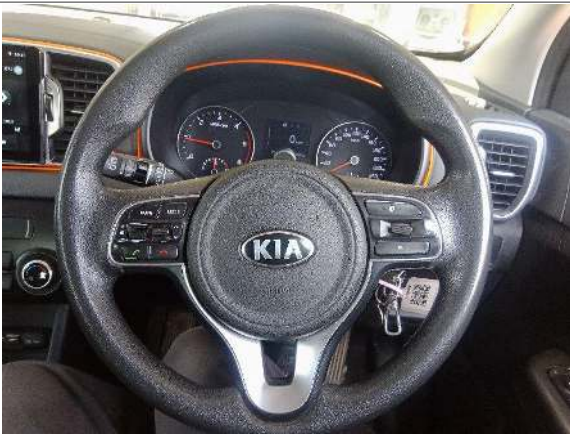
Steering Wheel Trim