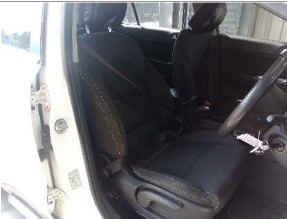
Seat Front Right