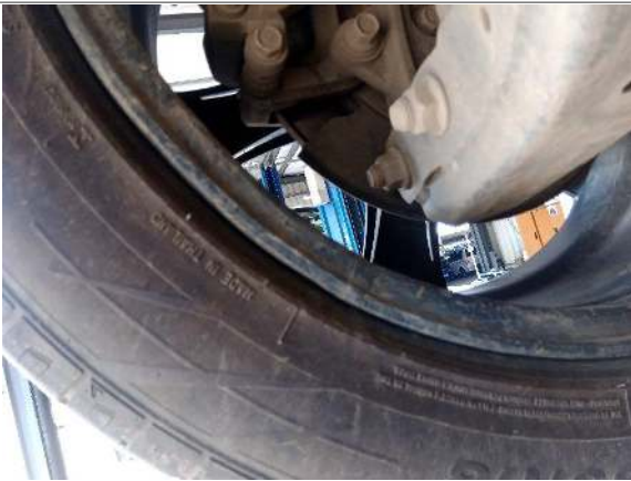
Rim Rear Left