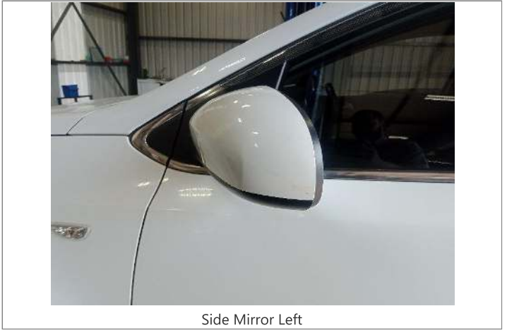
Side Mirror Left