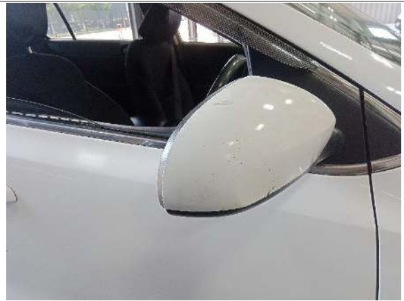
Side Mirror Right