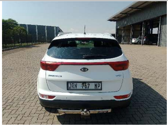
90 DEGREE REAR