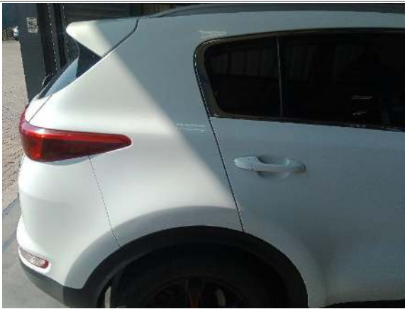
Rear Fender Right