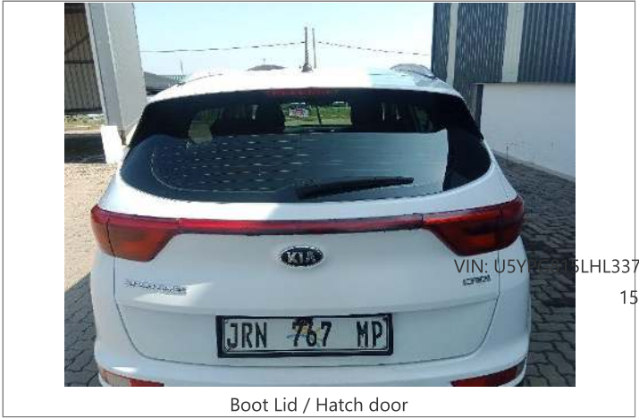
Boot Lid / Hatch door