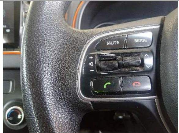
Steering Wheel Trim