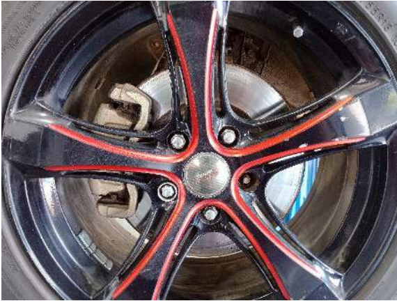
Bolt(s) / Nut(s) Front Wheel Left