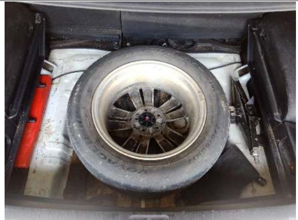
Spare wheel and Accessories