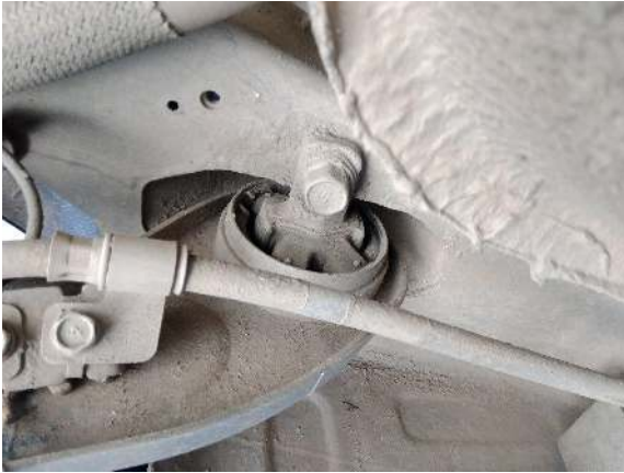
Mounting Rubber(s) Rear Axle Left