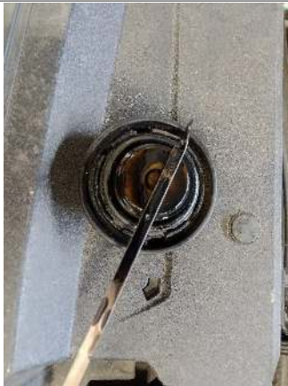
Oil cap and dipstick