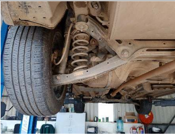
LR TYRE TREAD