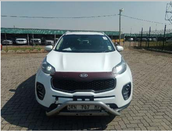
90 DEGREE FRONT