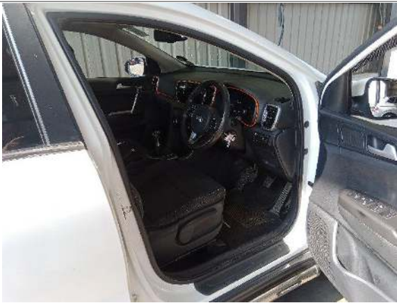
INTERIOR (FRONT DRIVER DOOR)