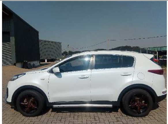
90 DEGREE LEFT