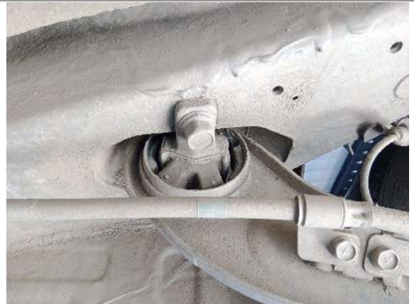
Mounting Rubber(s) Rear Axle Right