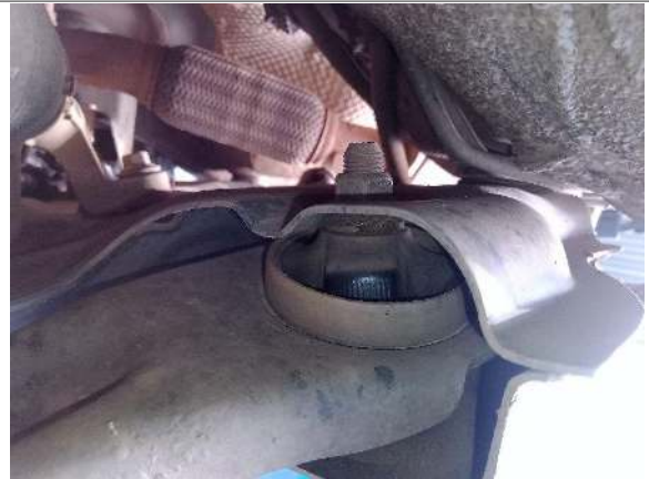
Control Arm Bush(es) Front Axle Left