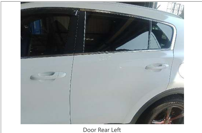
Door Rear Left