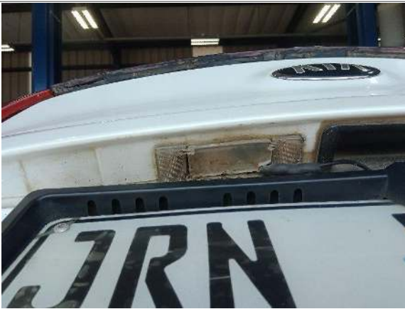
Number Plate Light Left