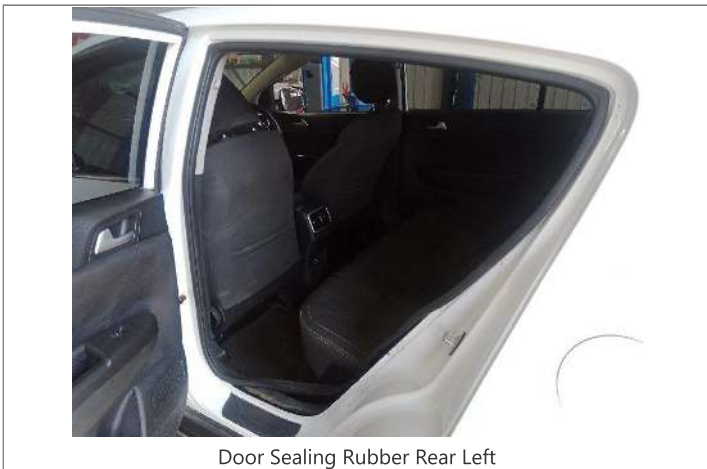
Door Sealing Rubber Rear Left