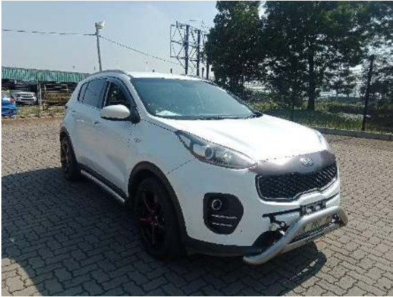
FRONT RIGHT CORNER