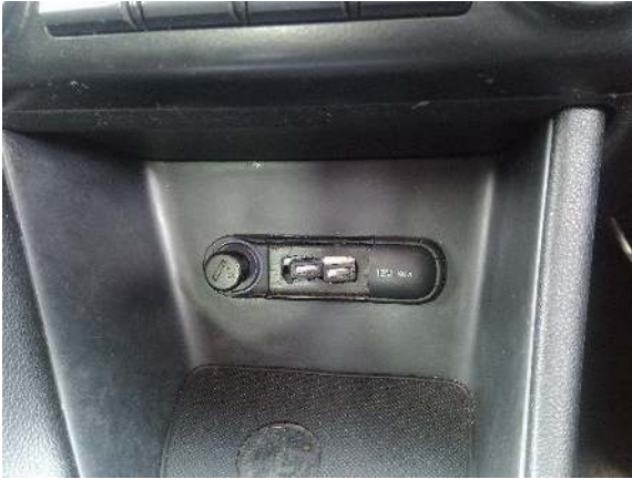
Center Console / Cubbyhole + Lid