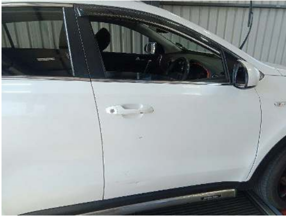
Door Front Right