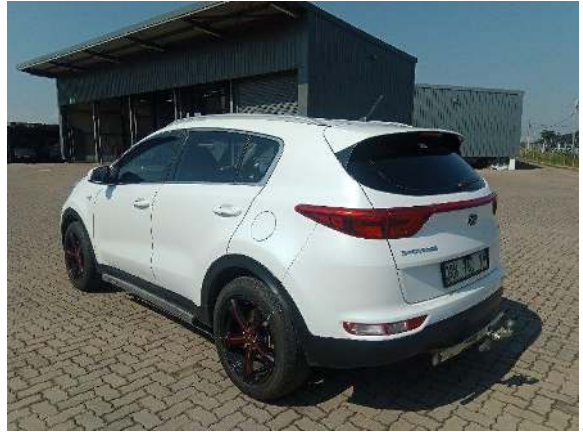
REAR LEFT CORNER