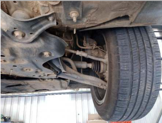
RF TYRE TREAD