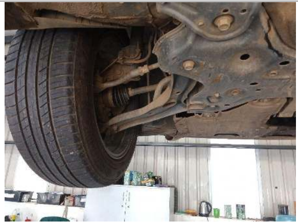
LF TYRE TREAD