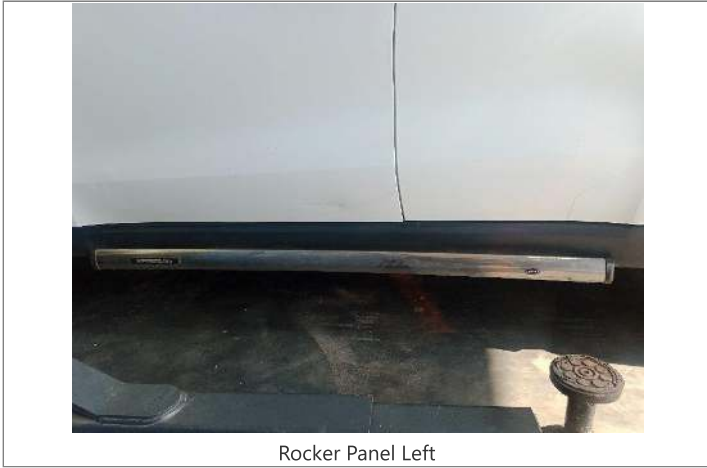
Rocker Panel Left