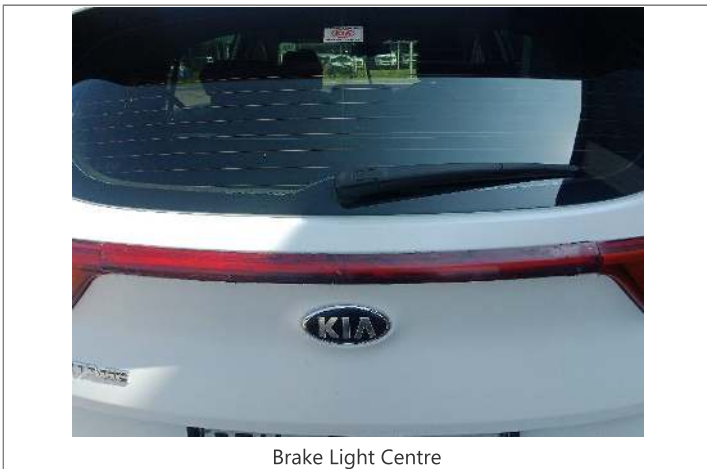
Brake Light Centre