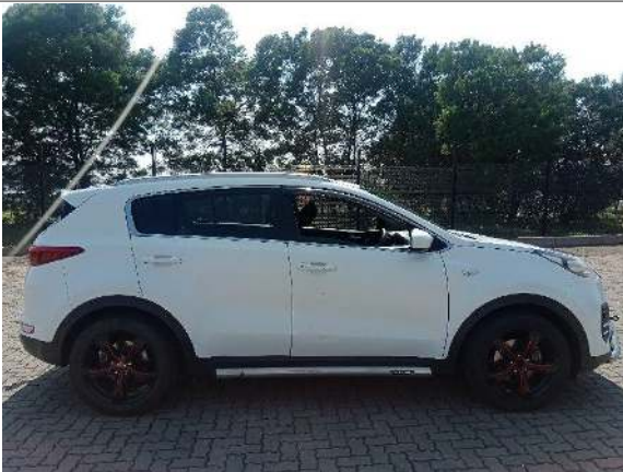
90 DEGREE RIGHT