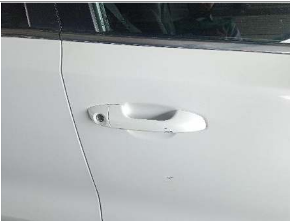
Door Handle Front Right