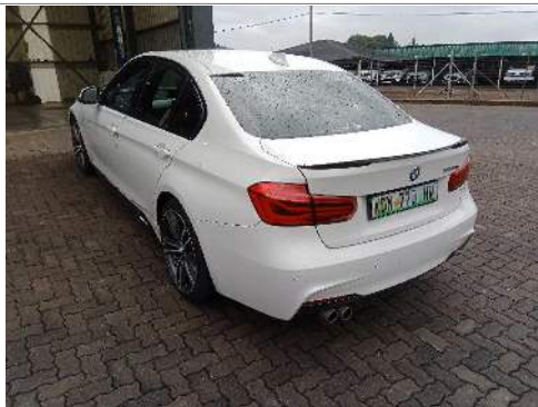
REAR LEFT CORNER