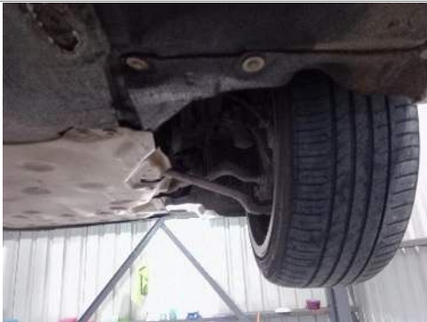
RF TYRE TREAD