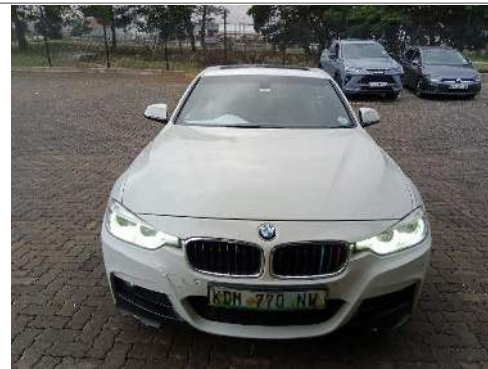
90 DEGREE FRONT