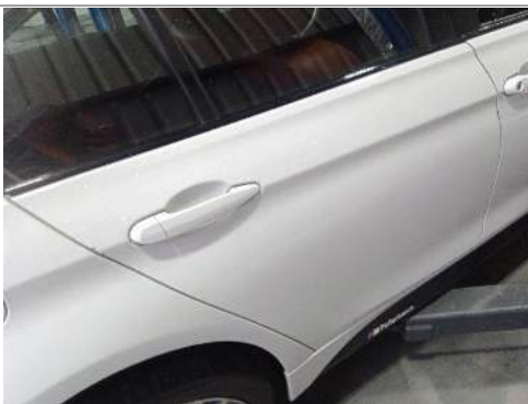
Door Rear Right