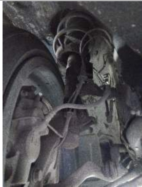
Shock Absorber Front Left

DEKRA Automotive (PTY) Ltd. 97 Willem Cruywagen Ave Klerksoord, Pretoria, 0200 Phone: 012 542 4867 www.dekraauto.co.za