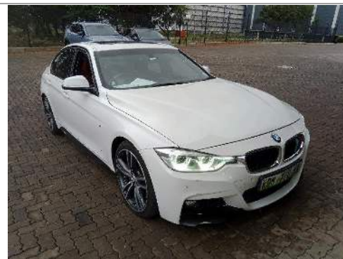
FRONT RIGHT CORNER