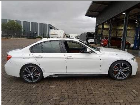
90 DEGREE RIGHT