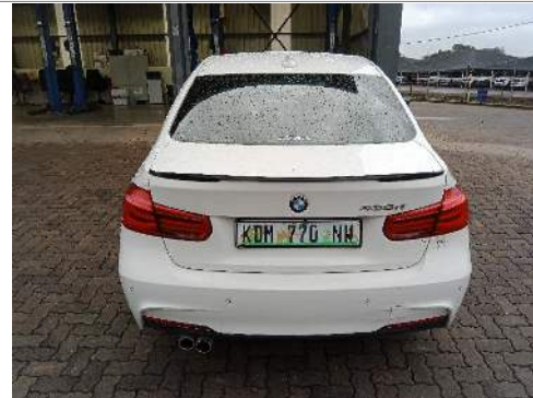
90 DEGREE REAR

DEKRA Automotive (PTY) Ltd. 97 Willem Cruywagen Ave Klerksoord, Pretoria, 0200 Phone: 012 542 4867 www.dekraauto.co.za