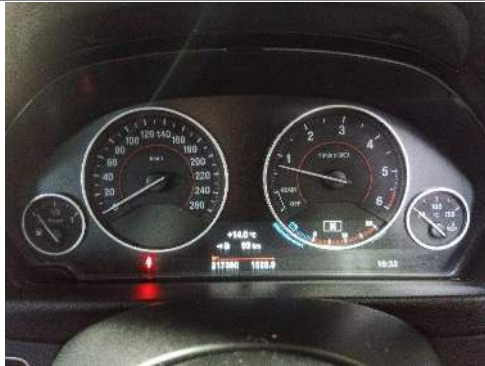
DASHBOARD (W/ ENGINE RUNNING)