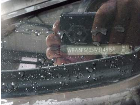
VIN PLATE OR STICKER