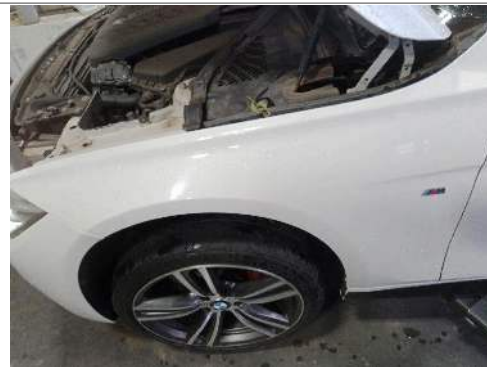
Front Fender Left