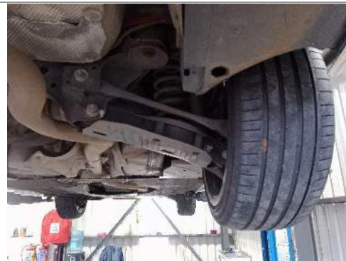
RR TYRE TREAD