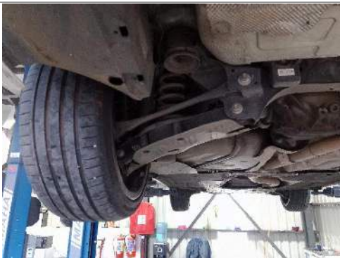
LR TYRE TREAD