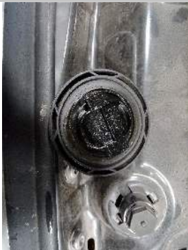
Oil cap and dipstick.