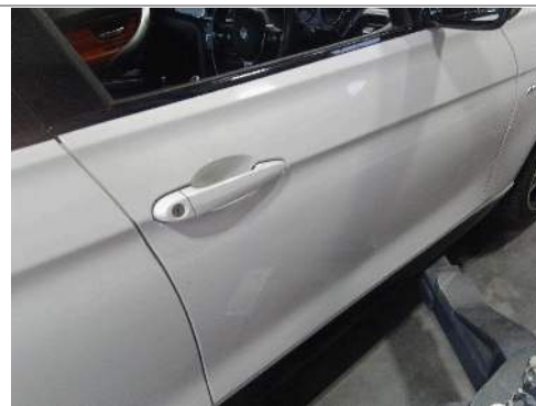
Door Front Right