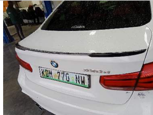
Boot Lid / Hatch door