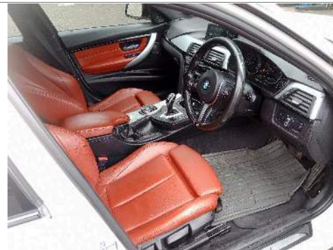
INTERIOR (FRONT DRIVER DOOR)

DEKRA Automotive (PTY) Ltd. 97 Willem Cruywagen Ave Klerksoord, Pretoria, 0200 Phone: 012 542 4867 www.dekraauto.co.za