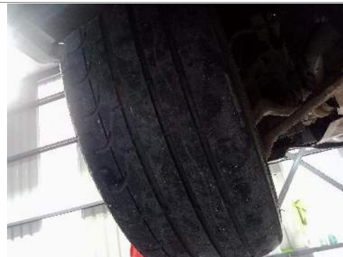
Tyre Front Left

DEKRA Automotive (PTY) Ltd. 97 Willem Cruywagen Ave Klerksord, Pretoria, 0200 Phone: 012 542 4867 www.dekraauto.co.za