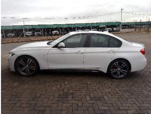
90 DEGREE LEFT