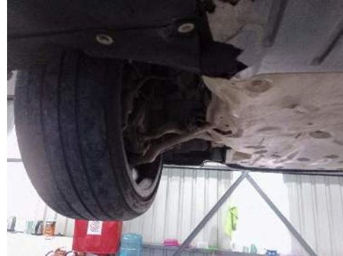
LF TYRE TREAD