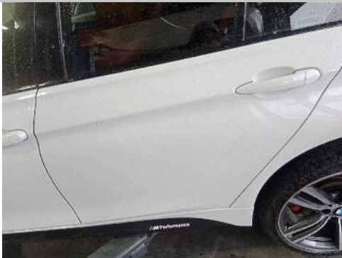
Door Rear Left