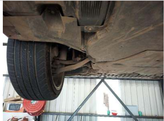
LF TYRE TREAD