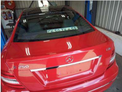
Number Plate Rear