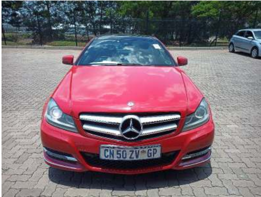
90 DEGREE FRONT