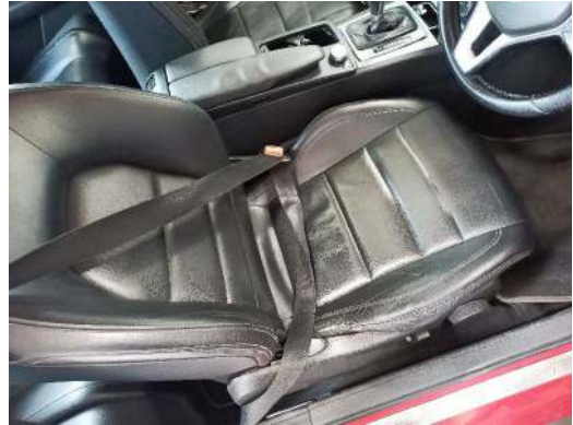
Seat Front Right