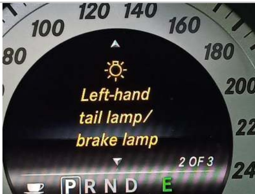
Tail Light Left