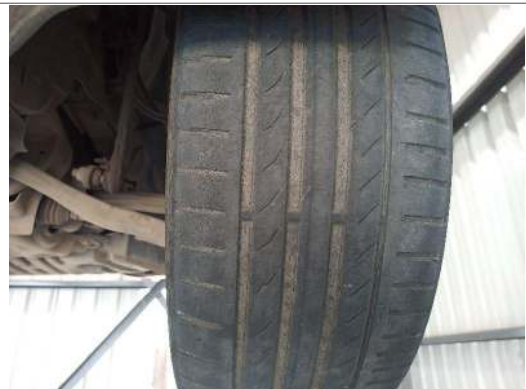
Tyre Front Right