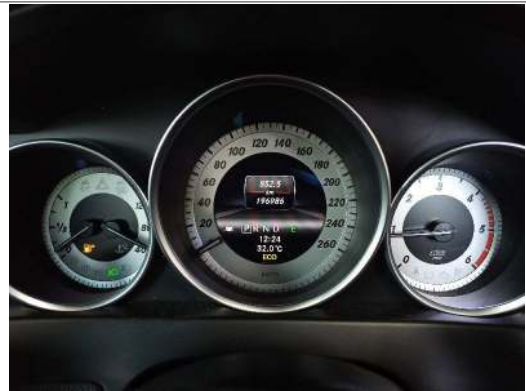
DASHBOARD (W/ ENGINE RUNNING)