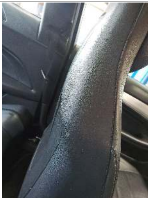
Seat Front Left