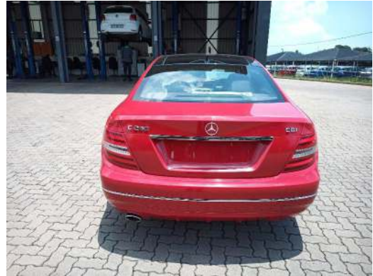
90 DEGREE REAR