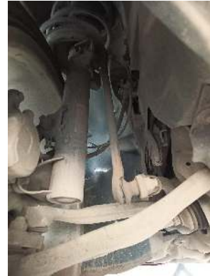
Stabilizer Mounting Front Left