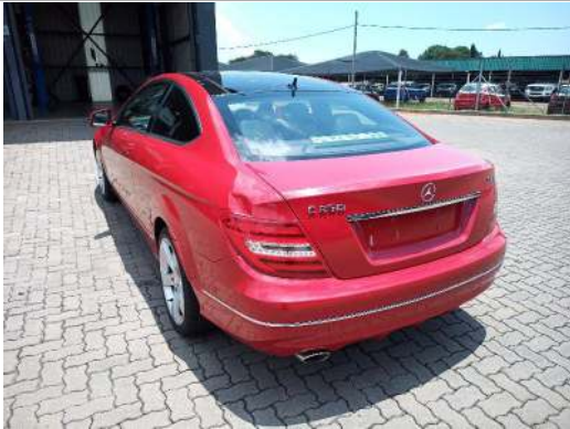
REAR LEFT CORNER