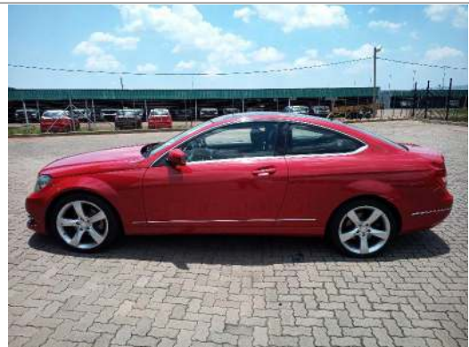
90 DEGREE LEFT