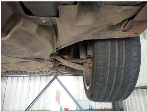
RF TYRE TREAD