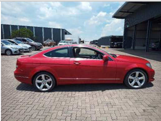
90 DEGREE RIGHT