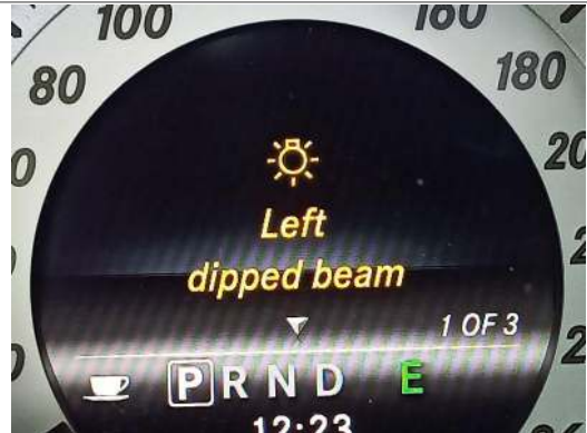
Dim Light Left