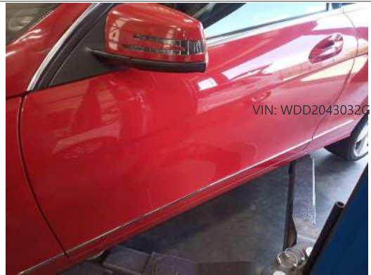
Door Front Left