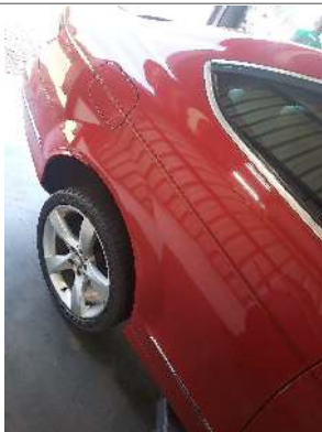
Rear Fender Right