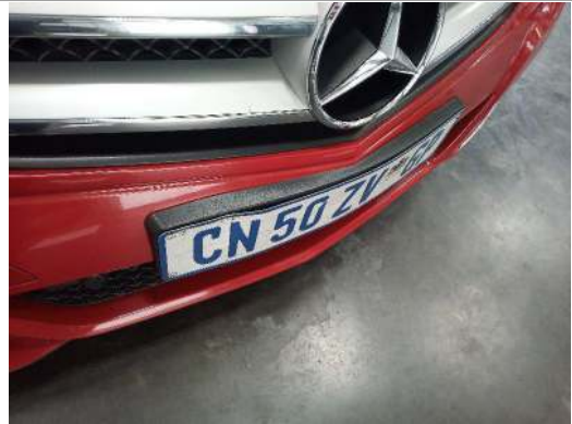
Number Plate Front