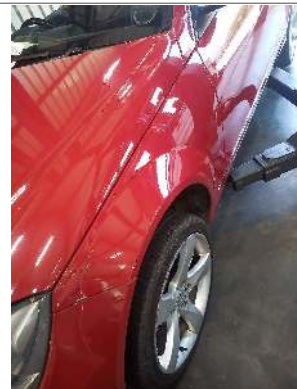
Front Fender Left