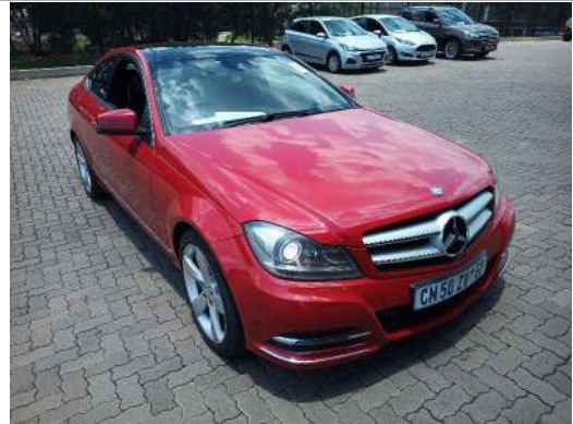
FRONT RIGHT CORNER