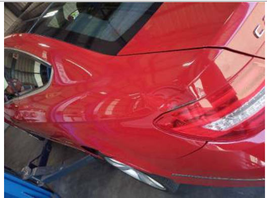
Rear Fender Left