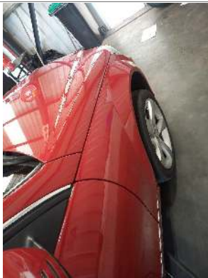
Front Fender Right