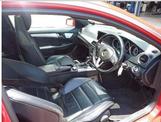
INTERIOR (FRONT DRIVER DOOR)