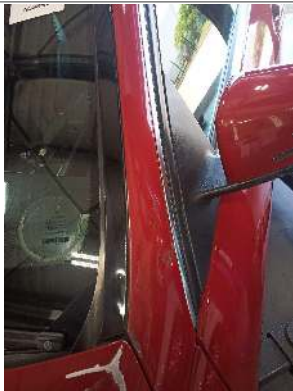
A • Pillar Left