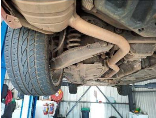
LR TYRE TREAD