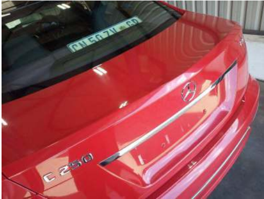
Boot Lid / Hatch door