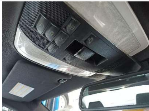
Sun Roof Switch