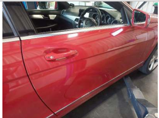
Door Front Right