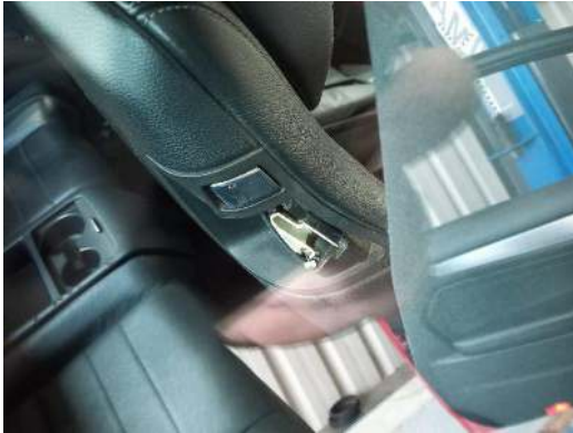
Seat Front Right