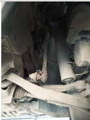
Stabilizer Mounting Front Right