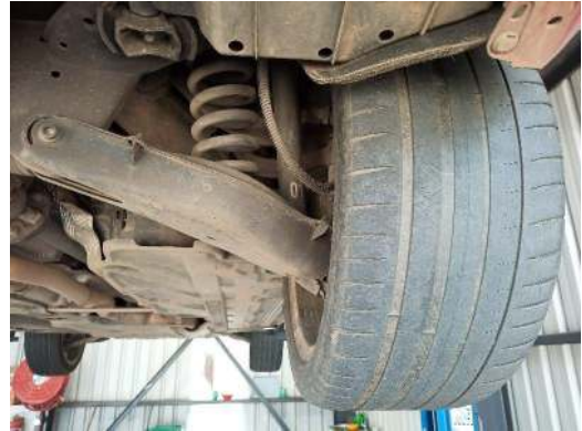
RR TYRE TREAD