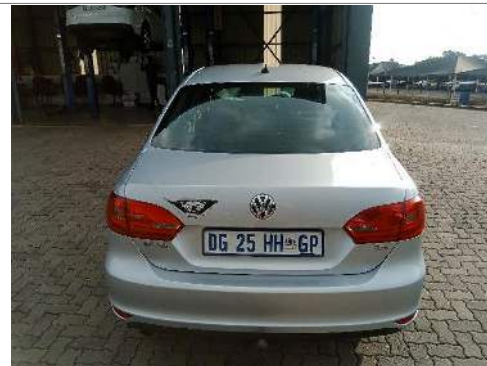
90 DEGREE REAR

DEKRA Automotive (PTY) Ltd. 97 Willem Cruywagen Ave Klerksord, Pretoria, 0200 Phone: 012 542 4867 www.dekraauto.co.za