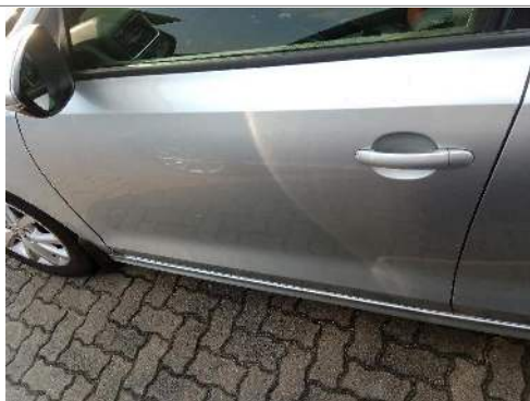
Door Front Left