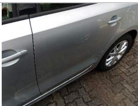
Door Rear Left