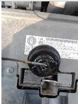
Oil cap and dipstick.