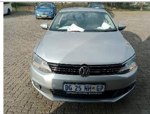
90 DEGREE FRONT