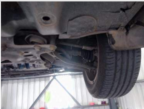
RF TYRE TREAD