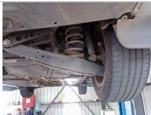
RR TYRE TREAD