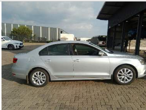
90 DEGREE RIGHT