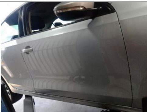
Door Front Right