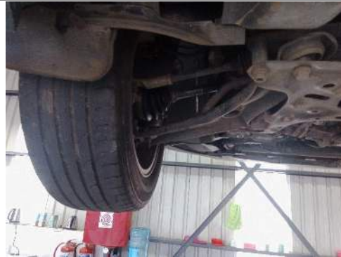
LF TYRE TREAD