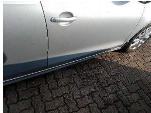
Sill Panel Right