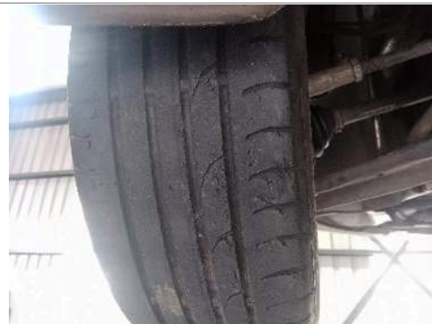
Tyre Front Left

DEKRA Automotive (PTY) Ltd. 97 Willem Cruywagen Ave Klerksord, Pretoria, 0200 Phone: 012 542 4867 www.dekraauto.co.za