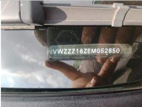
VIN PLATE OR STICKER