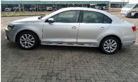
90 DEGREE LEFT