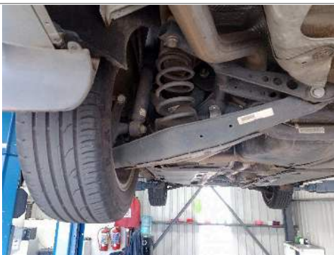
LR TYRE TREAD