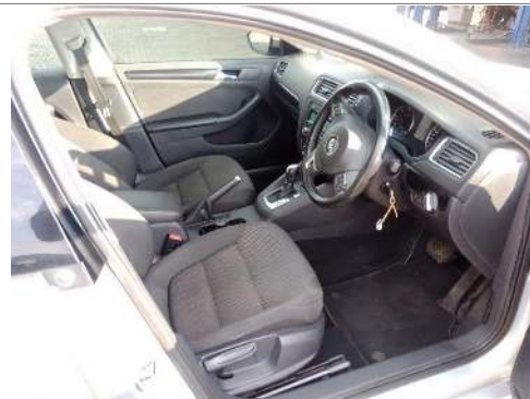
INTERIOR (FRONT DRIVER DOOR)

DEKRA Automotive (PTY) Ltd. 97 Willem Cruywagen Ave Klerksoord, Pretoria, 0200 Phone: 012 542 4867 www.dekraauto.co.za