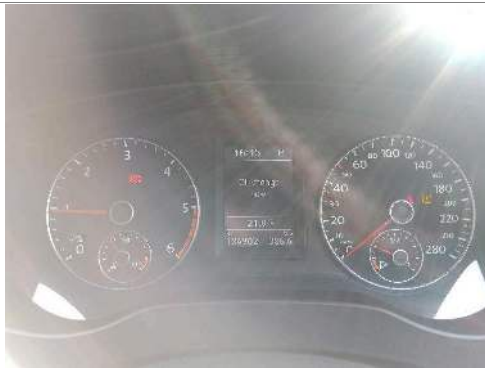
DASHBOARD (W/ ENGINE RUNNING)